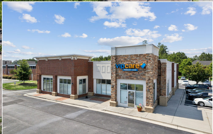
5610 Wendy Bagwell Pkwy

Traffic Volume - 34,149 Wendy Bagwell Parkway / US-278 Heavily traveled retail corridor and main tributary to Atlanta