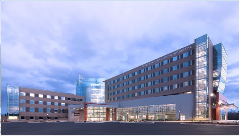
Wellstar Paulding Medical Center (Moody's A2) 294 Beds