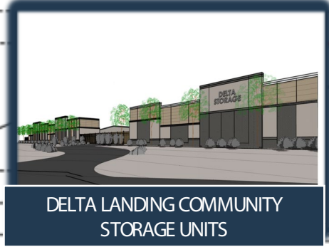
DELTA LANDING COMMUNITY STORAGE UNITS