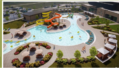
DAN MADDOX $30M+ YMCA

LAKES, HIKING TRAILS, PARK & PLAYGROUND, SPORTS FIELDS, ONSITE STORAGE UNITS, YMCA and more