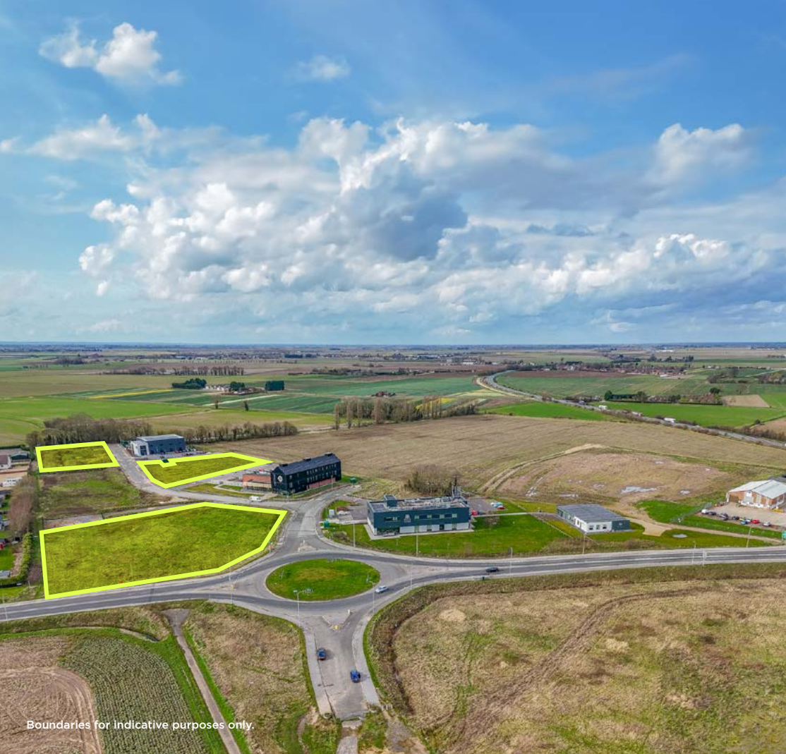
Boundaries for indicative purposes only.