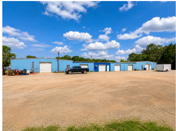
SPARTANBURG COUNTY TAX MAP #6-26-00-006.01