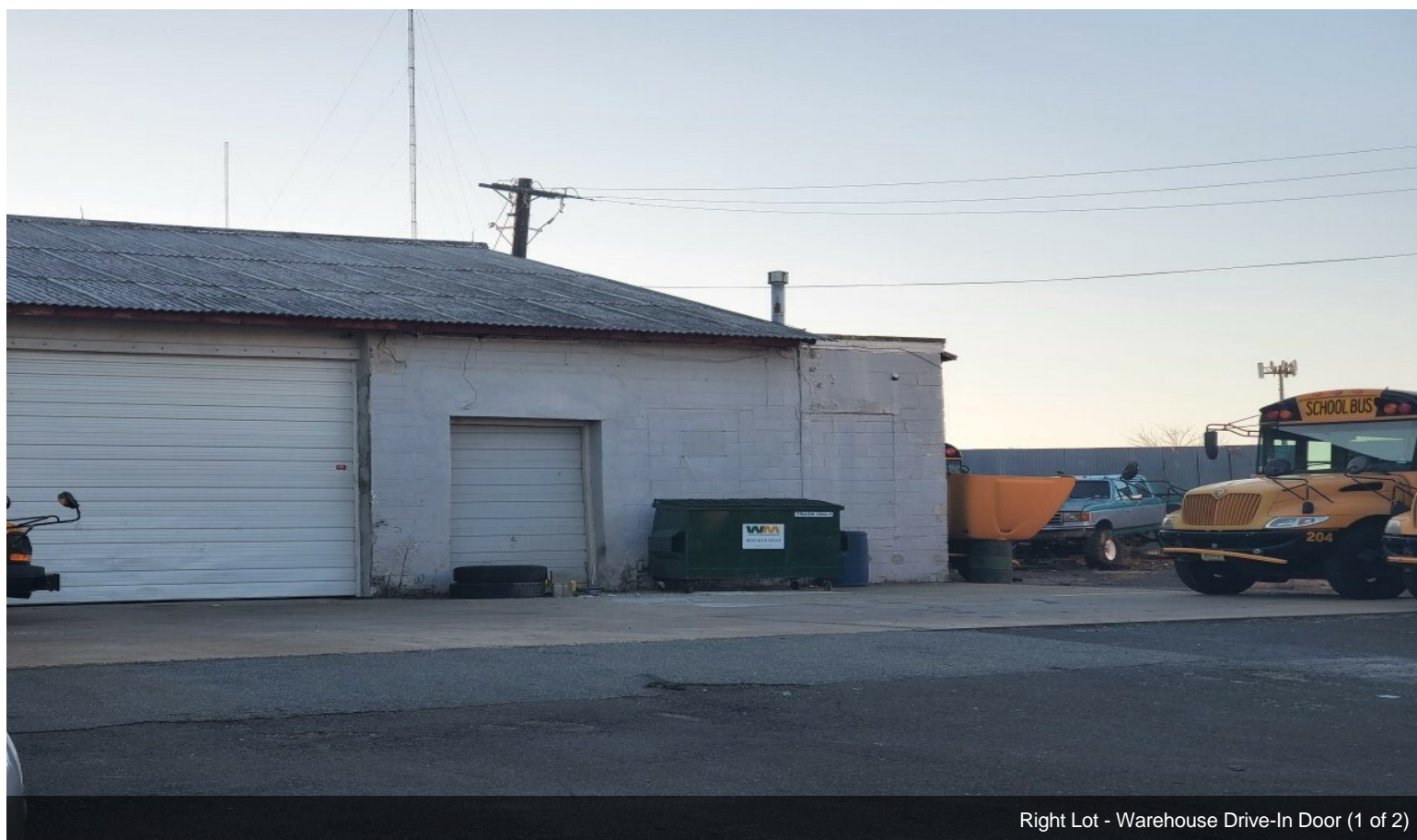
Right Lot - Warehouse Drive-In Door (1 of 2)