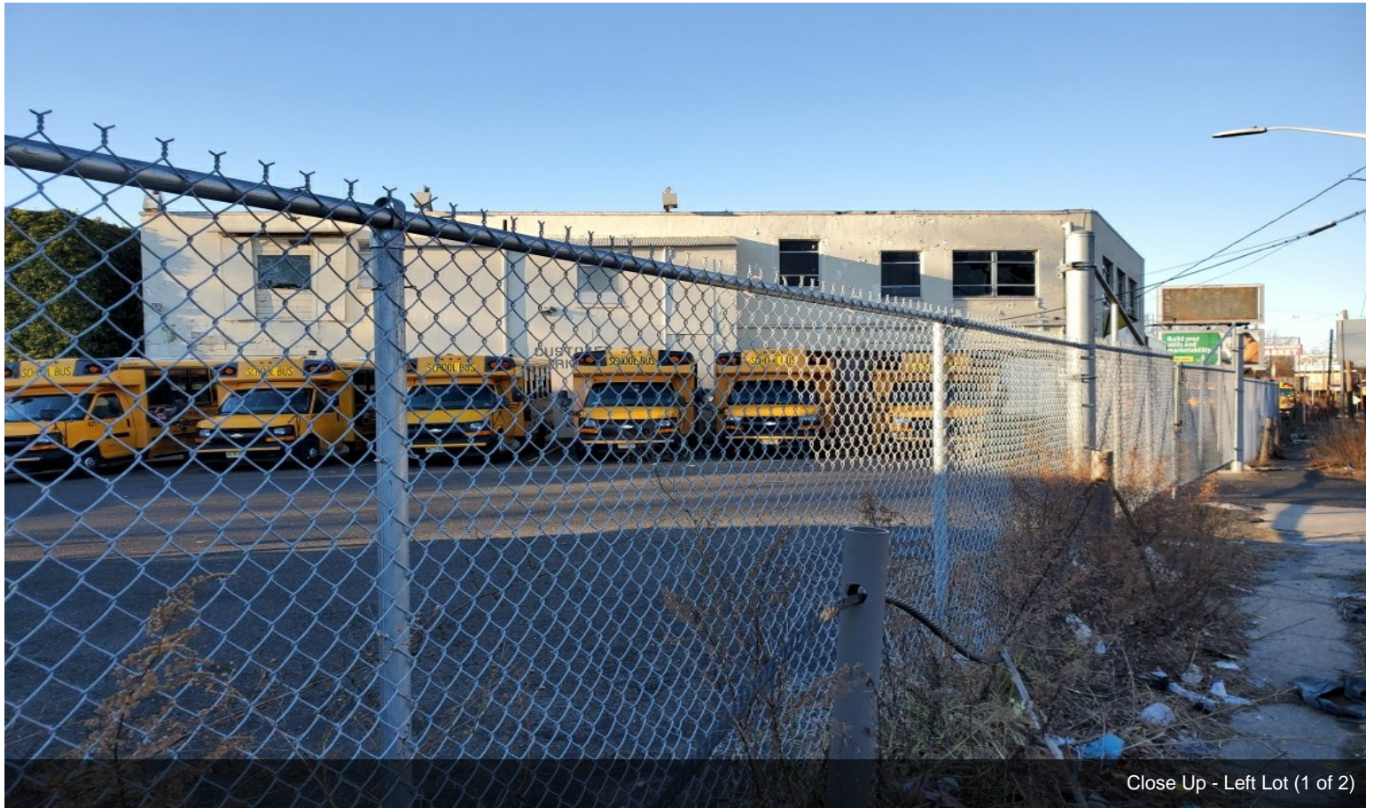
Close Up - Left Lot (1 of 2)