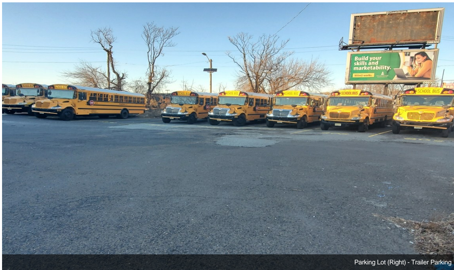
Parking Lot (Right) - Trailer Parking