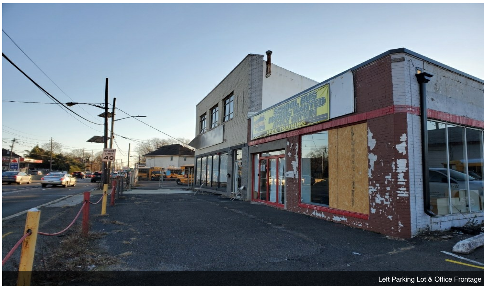
Left Parking Lot & Office Frontage