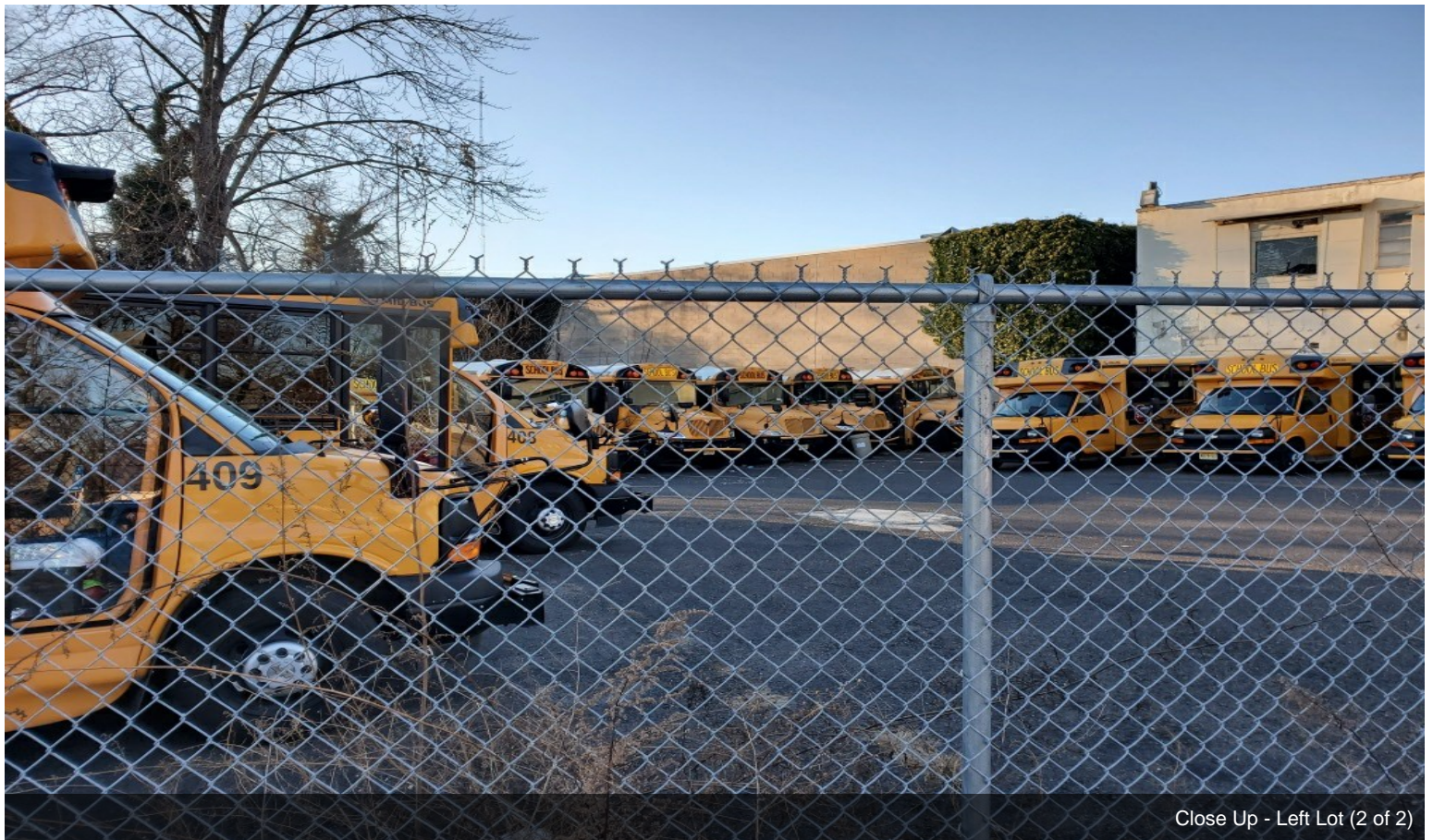
Close Up - Left Lot (2 of 2)