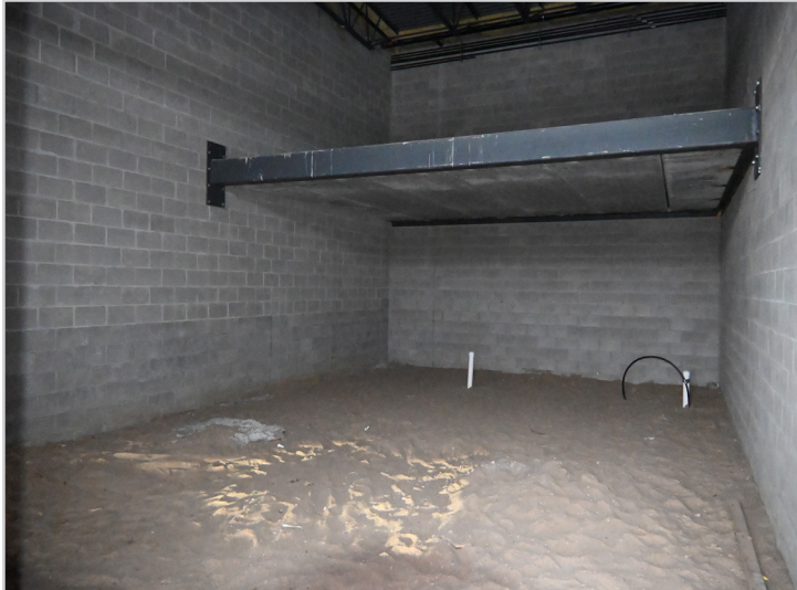
Standard Unit with Dirt Floor and Rough-ins