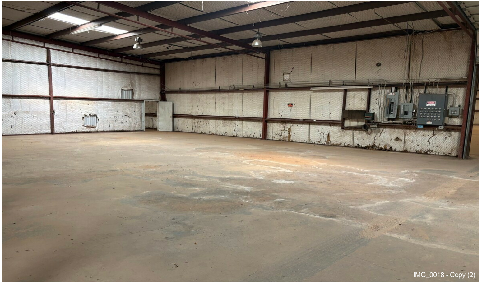
IMG_0018 - Copy (2)