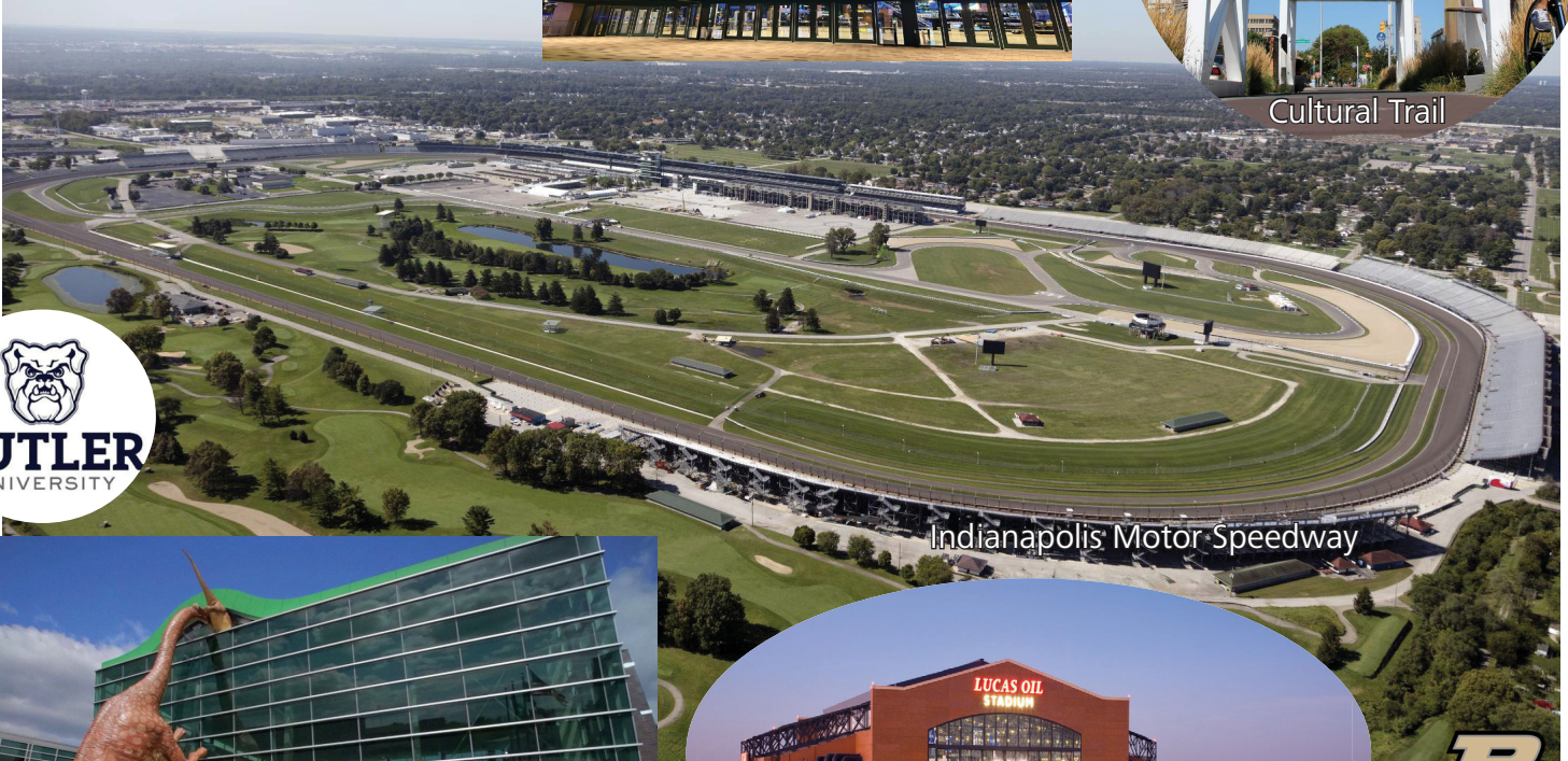
Indianapolis Motor Speedway