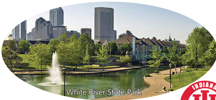
White River State Park