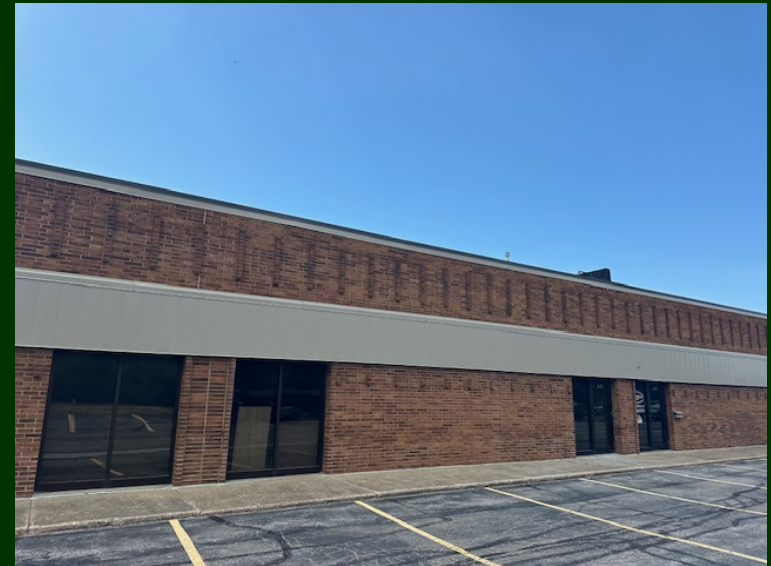
7150 Hart St., A-1, Mentor, OH 44060

No warranty or representation, express or implied, is made as to the accuracy of the information contained herein. It is submitted subject to errors, omissions, price changes, rental or other conditions, withdrawal without notice, and to any special listing conditions imposed by our client.