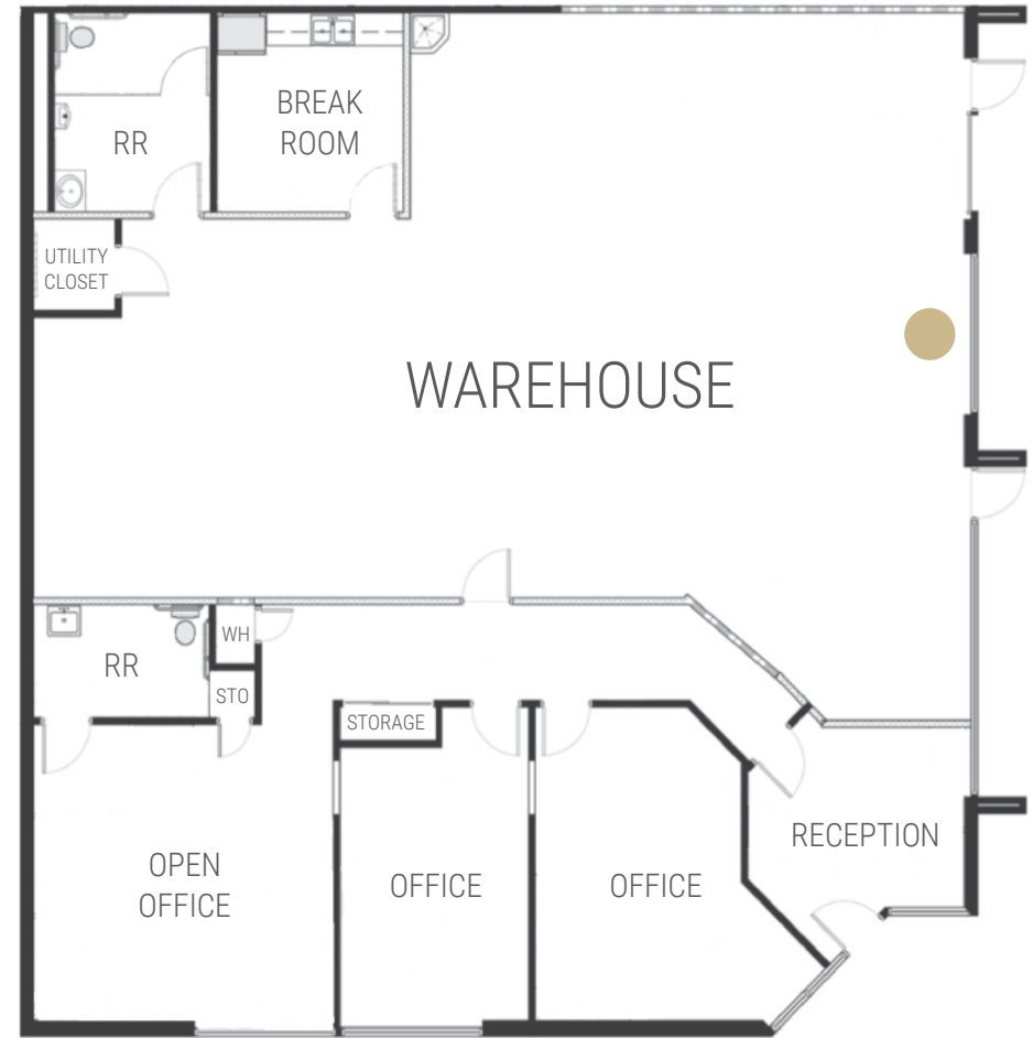
● = 10' X 12' GRADE DOOR

Information is subject to change at any time. The information provided has been obtained from sources believed reliable. While we do not doubt its accuracy, we make no guarantee, warranty, or representation about it. It is your responsibility to independently confirm its accuracy.