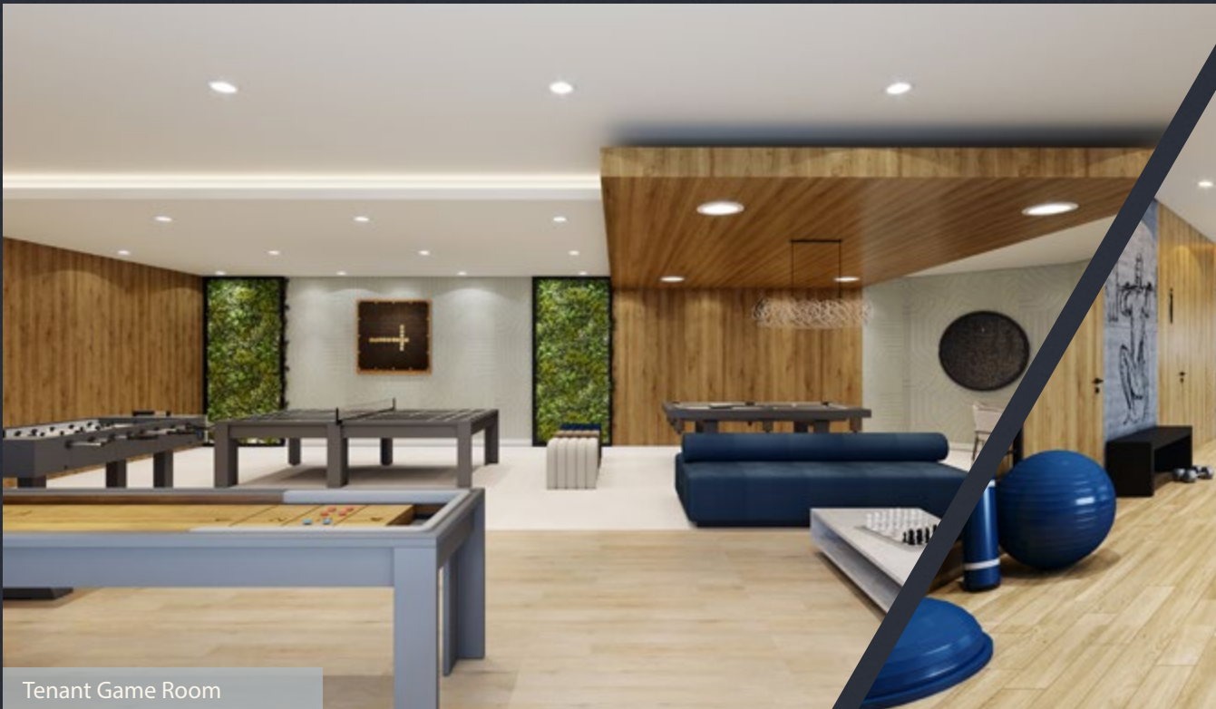
Tenant Game Room