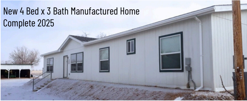
New 4 Bed x 3 Bath Manufactured Home Complete 2025