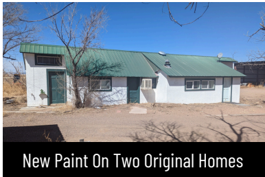
New Paint On Two Original Homes