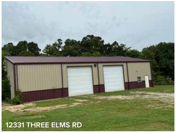
12331 THREE ELMS RD