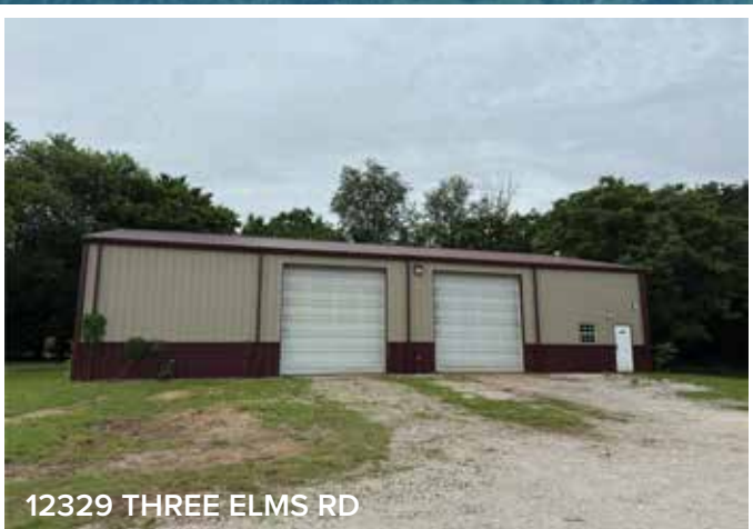
12329 THREE ELMS RD