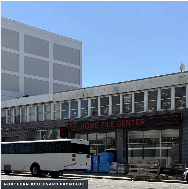
NORTHERN BOULEVARD FRONTAGE