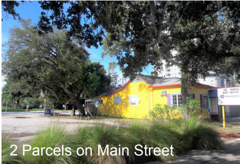
2 Parcels on Main Street