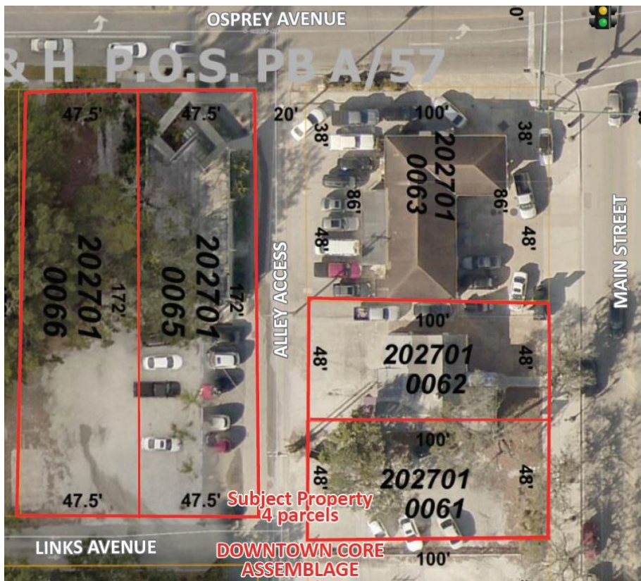
Subject Property 4 parcels