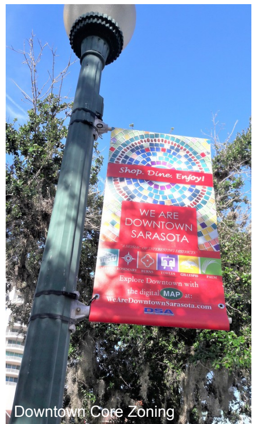
Downtown Core Zoning