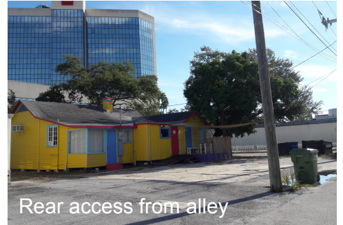
Rear access from alley