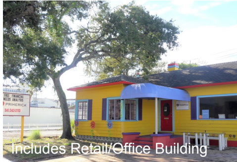
Includes Retail/Office Building