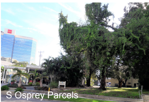
5 Osprey Parcels