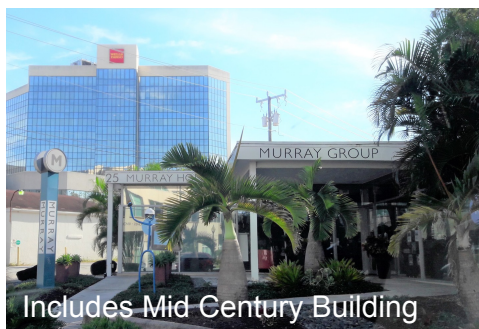
Includes Mid Century Building