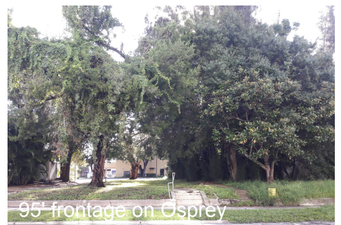
95' frontage on Osprey