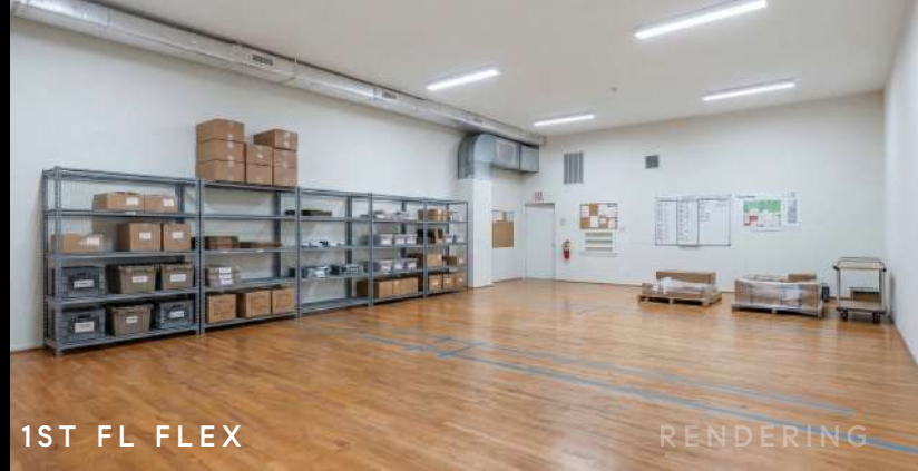
1ST FL FLEX