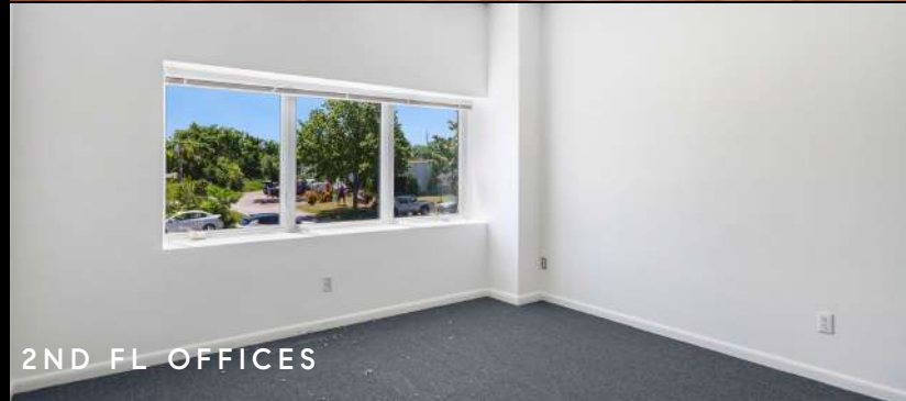
2ND FL OFFICES