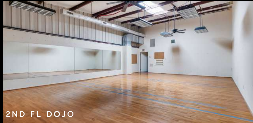
2ND FL DOJO