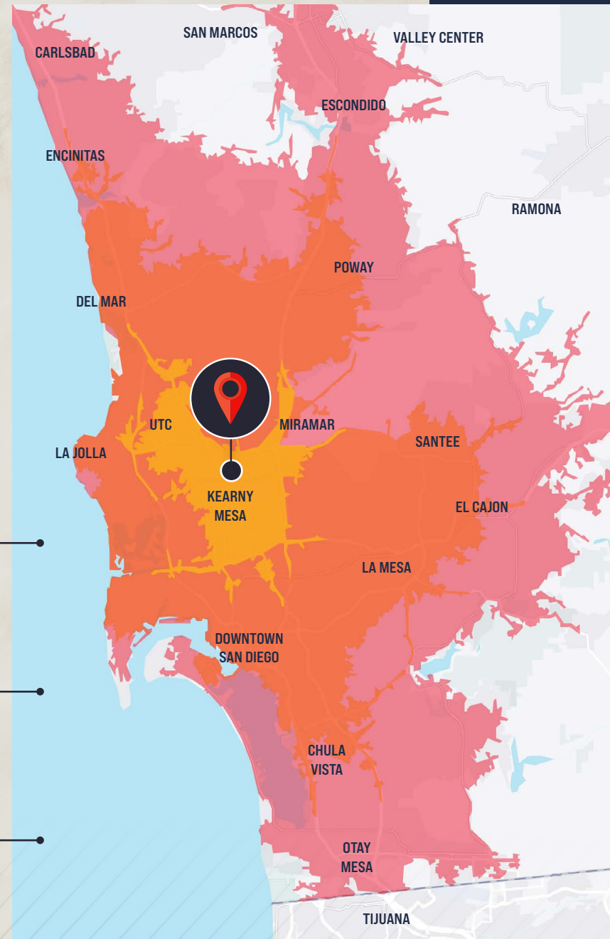
➔ SAN DIEGO COUNTY DRIVE TIMES