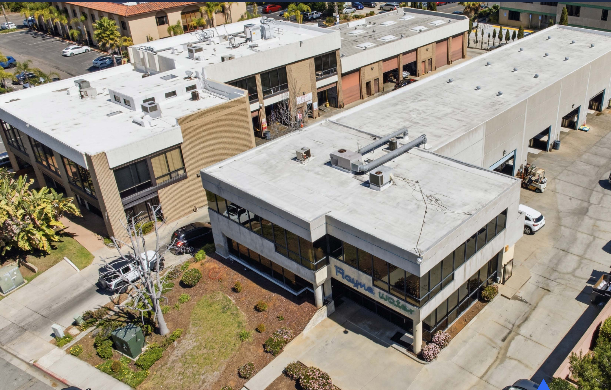
Strategically Located \pm 10,675 SF Freestanding Industrial Asset in Kearny Mesa