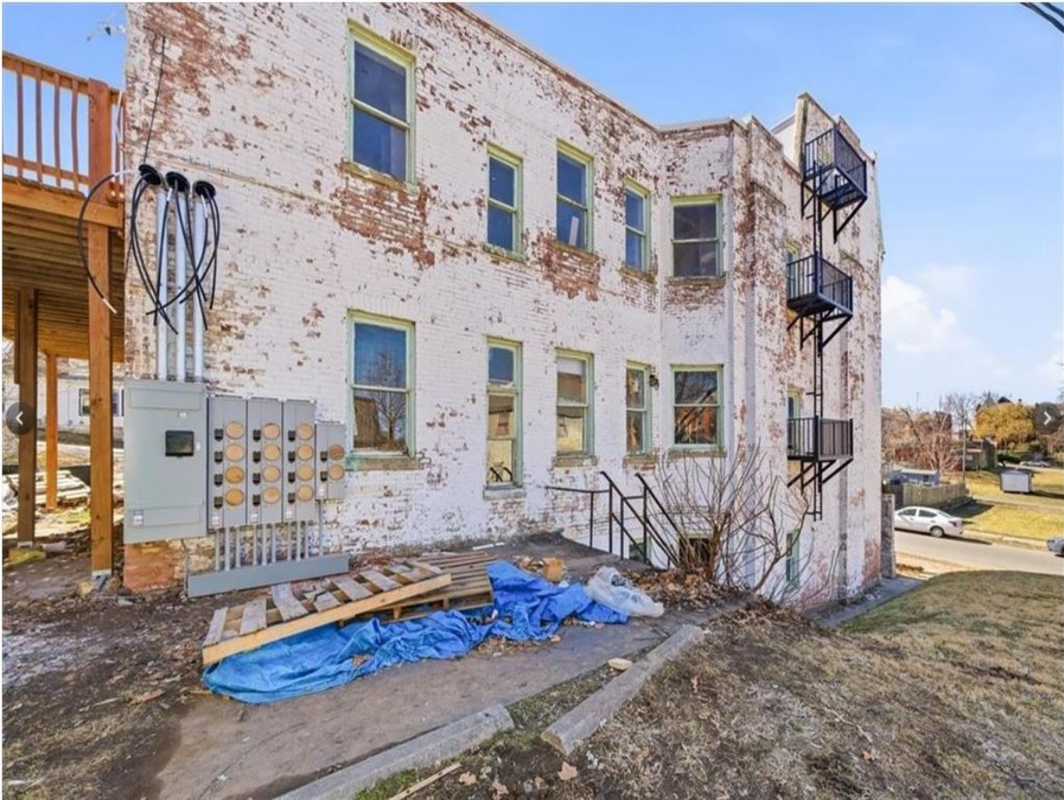
Exterior — Side View with Updated Fire Escapes & Electrical Panel