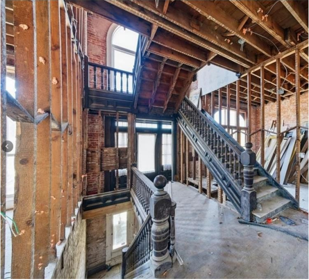
Interior — Original Staircase & Open Floor Plan