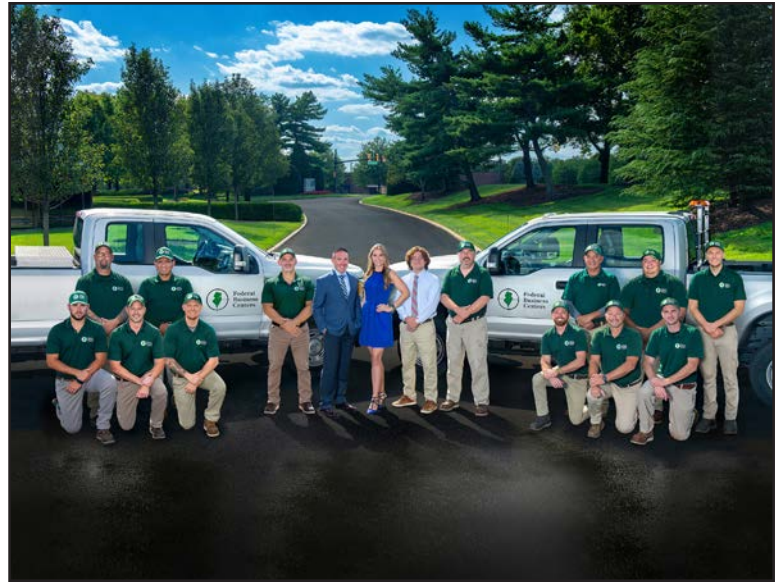
Building Maintenance Department