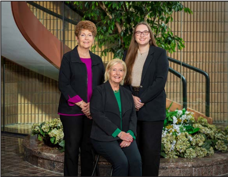
Customer Relations Department