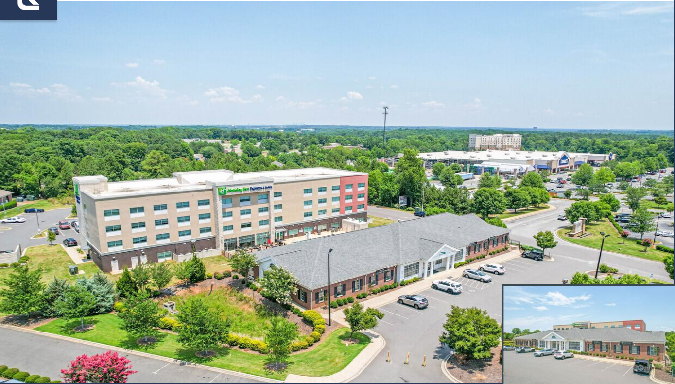
Off Baxter Fort Mill