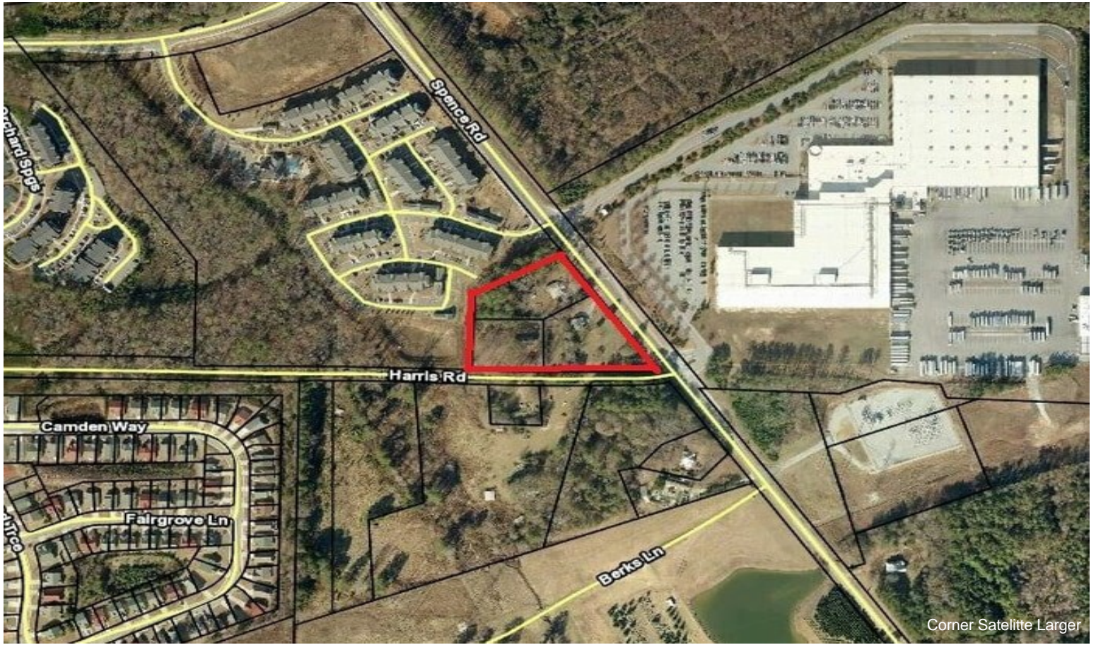
Comer Satellite Larger