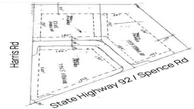
Potential Individual Lot Development