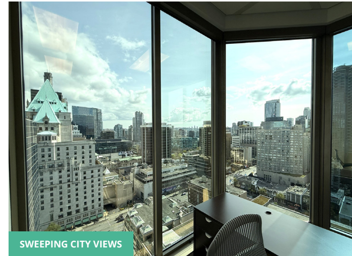
SWEEPING CITY VIEWS