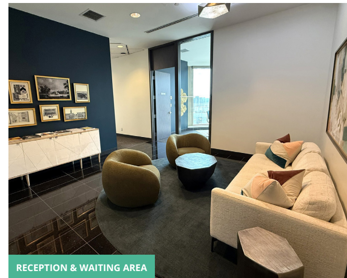
RECEPTION & WAITING AREA