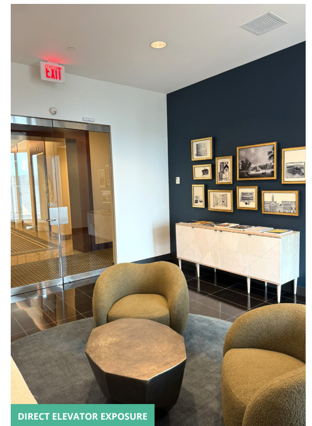
DIRECT ELEVATOR EXPOSURE