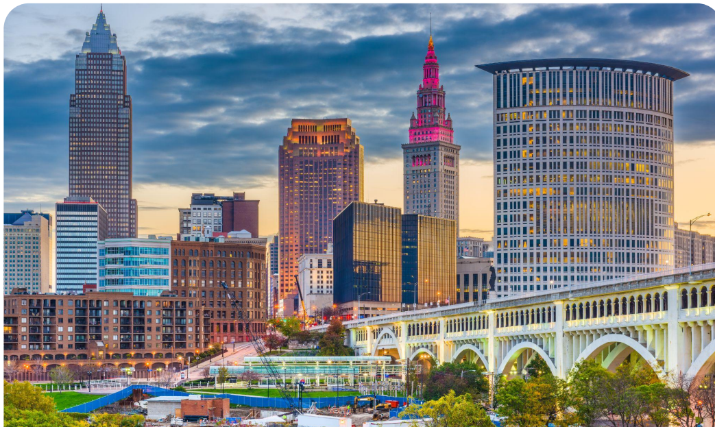
Cleveland, OH | ±36 Miles Away

The local economy benefits from a diverse employment base supported by healthcare, advanced manufacturing, education, professional services, and logistics sectors. Major regional employers including Summa Health, Cleveland Clinic Akron General, Goodyear Tire & Rubber, and Akron Children's Hospital provide workforce stability and sustained economic activity throughout the area. The city also benefits from the broader innovation and polymer research ecosystem associated with the University of Akron and Northeast Ohio's industrial legacy. Residential demand remains supported by strong public amenities, highly accessible retail corridors, and a growing preference for suburban communities offering outdoor recreation and quality-of-life advantages.