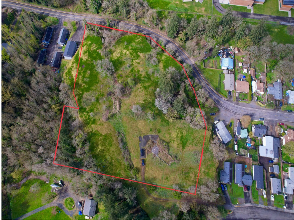
Approximate property lines