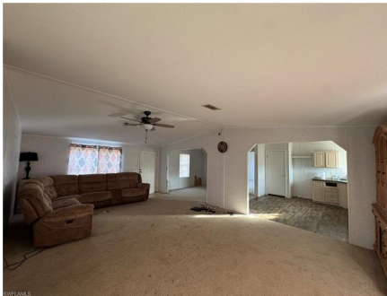
Unfurnished living room with light colored carpet, ceiling fan, and lofted ceiling