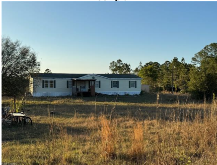
View of front of home