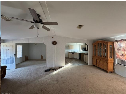
Unfurnished living room with light colored carpet, ceiling fan, and lofted ceiling