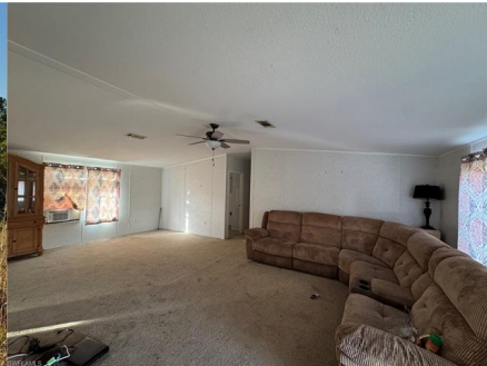
Living room featuring a textured ceiling, carpet floors, and ceiling fan