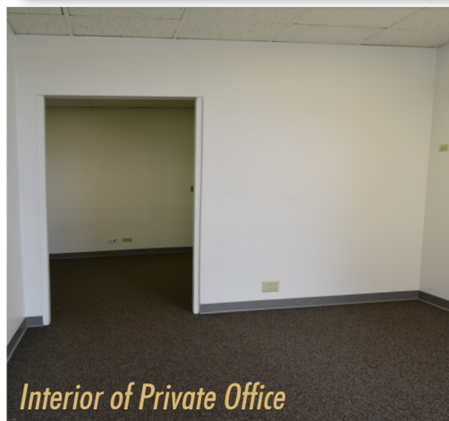
Interior of Private Office

All information contained herein is for advertising and promotional purposes. Data gathered was obtained from sources our brokerage believes to be reliable. Anna International Realty does not guarantee, warrant or represent information is 100% accurate. Interested parties should conduct an independent investigation as to the data provided within this property overview. Facts may be subject to errors, omissions, price changes or other extemporaneous conditions without public notice.