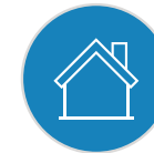
NUMBER OF HOUSEHOLDS