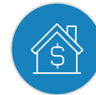
AVG. HOUSEHOLD INCOME