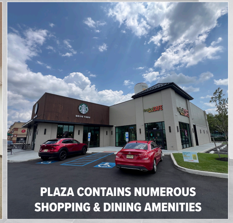
PLAZA CONTAINS NUMEROUS SHOPPING & DINING AMENITIES