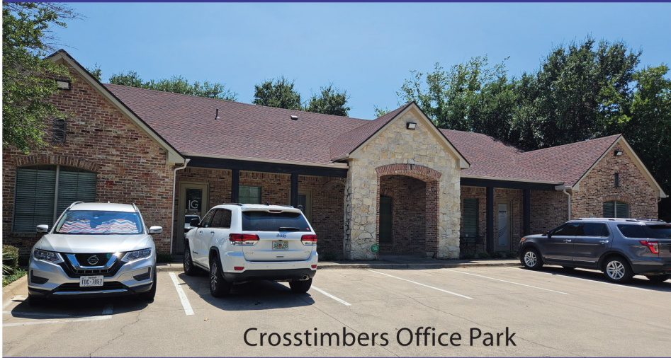
Crosstimbers Office Park