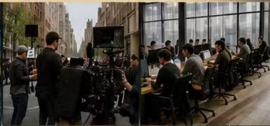
FILM & TV PRODUCTION STUDIOS