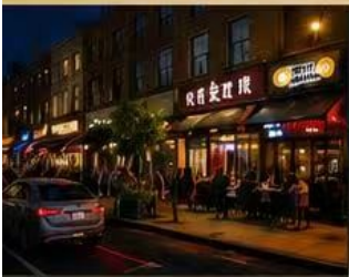
RESTAURANTS & BARS

Located in the heart of Astoria on a bustling commercial corridor, surrounded by bars, supermarkets, film & TV production studios, offices, and a diverse mix of businesses and residential communities.