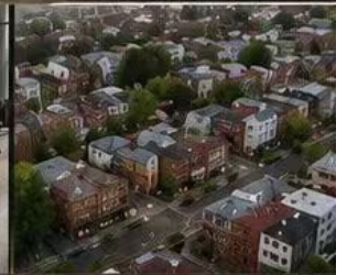
OFFICES & RESIDENTIAL AREA