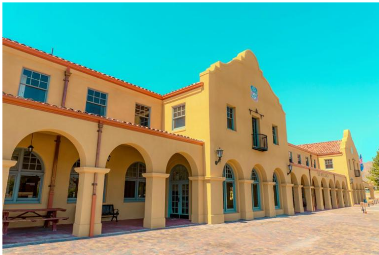
Railroad Depot in Caliente, NV

This information has been secured from sources we believe to be reliable, but we make no representations or warranties, expressed or implied, as to the accuracy of the information. Buyer must verify the information and bears all risk for any inaccuracies.