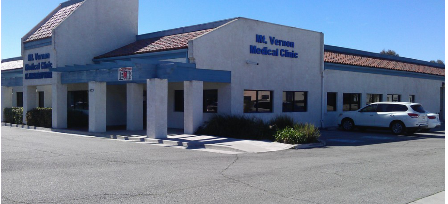
1023 South Mount Vernon Avenue, Colton - exterior entrance