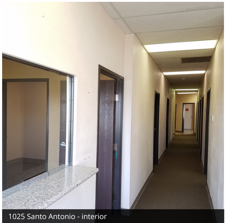
1025 Santo Antonio - interior