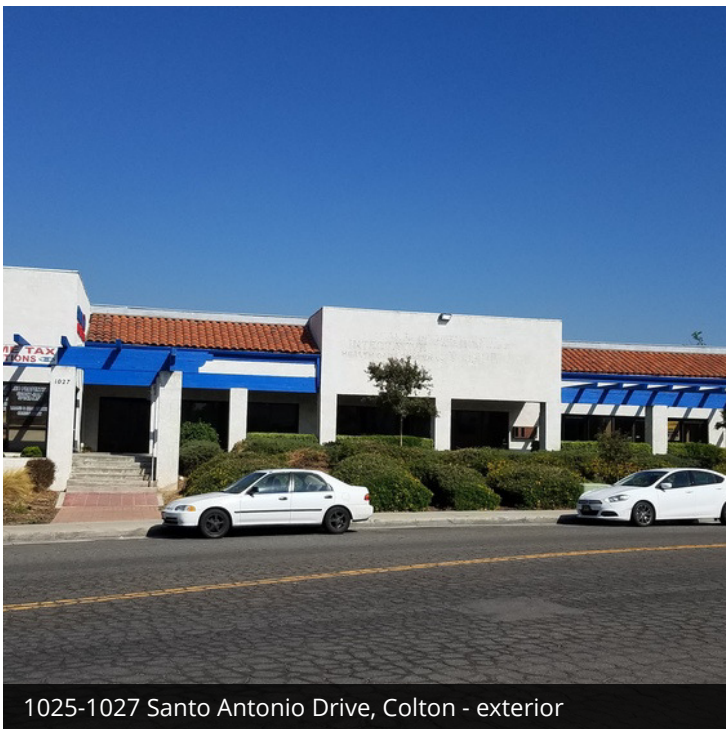
1025-1027 Santo Antonio Drive, Colton - exterior