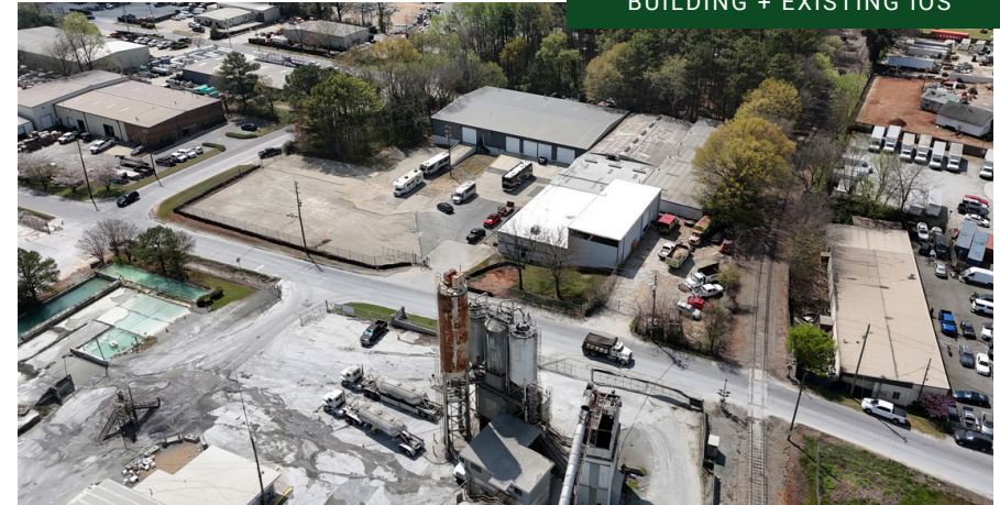
BUILDING + EXISTING IOS

LOADING 2 Dock High Doors 6 Grade Level Doors