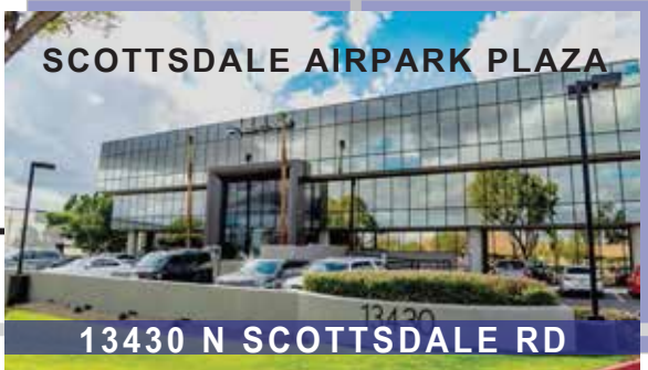
13430 N SCOTTSDALE RD