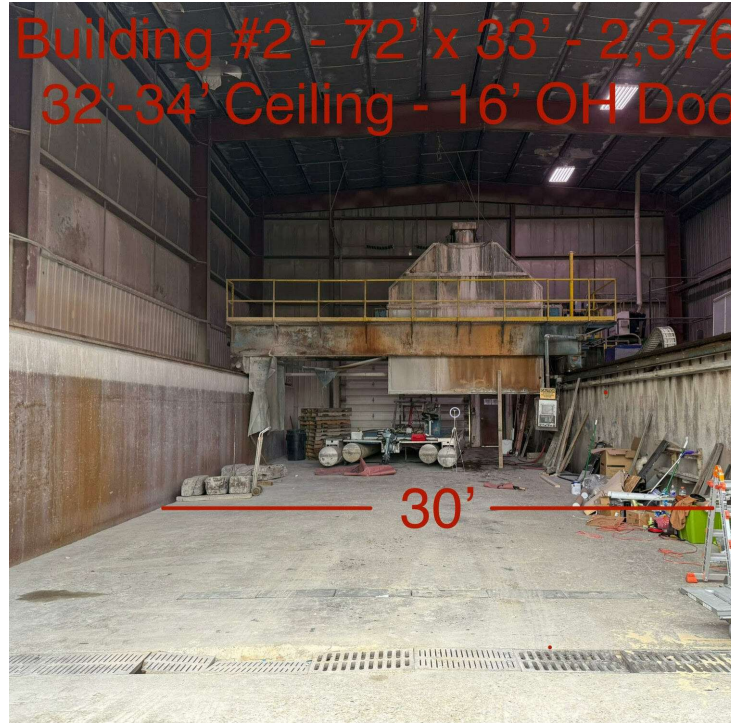
Building #2 - 72' x 33' - 2,376 32'-34' Ceiling - 16' OH Doc