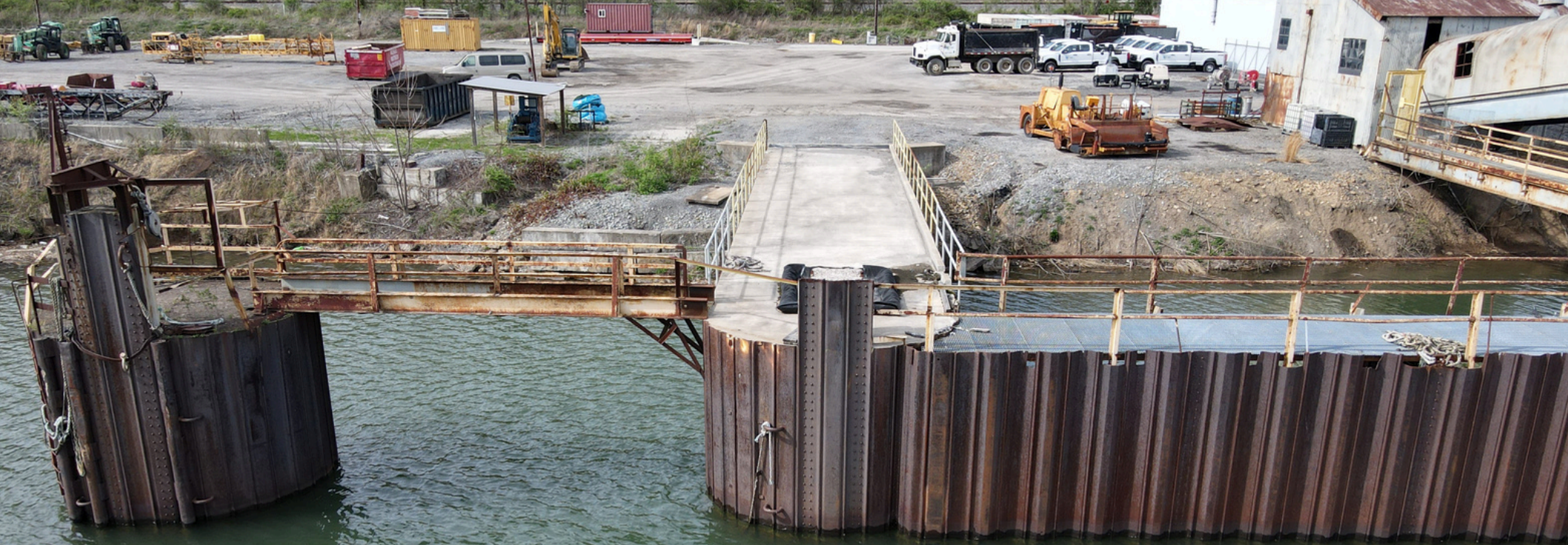
BARGE OFFLOADING AREA | DECK BARGE DOCK | 14' DRIVE IN DOORS