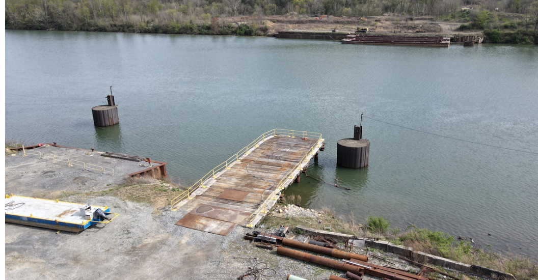
TRUCK SCALE W/ TICKET HOUSE | RIVER MOORING CELL TIE OFFS