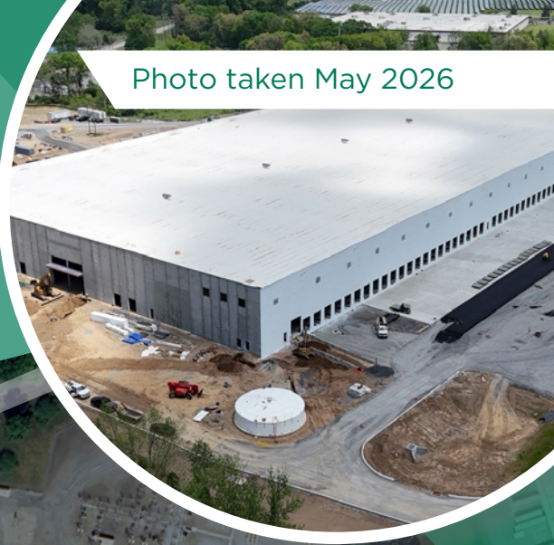
Photo taken May 2026