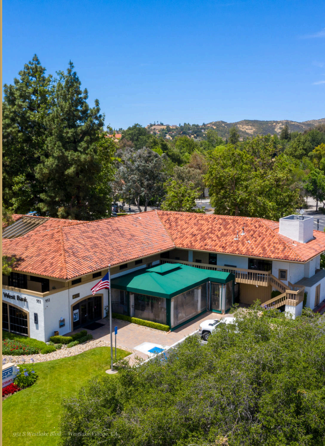
951 S Westlake Blvd — Westlake Village, CA