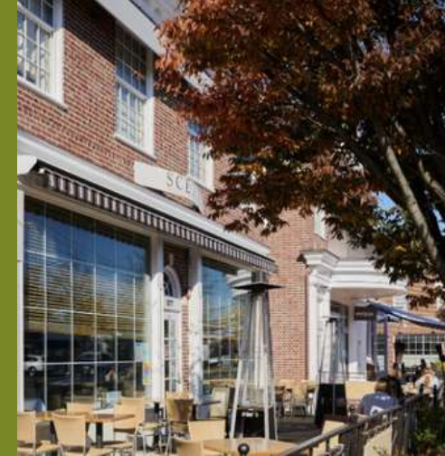
Scena – 1077 Boston Post