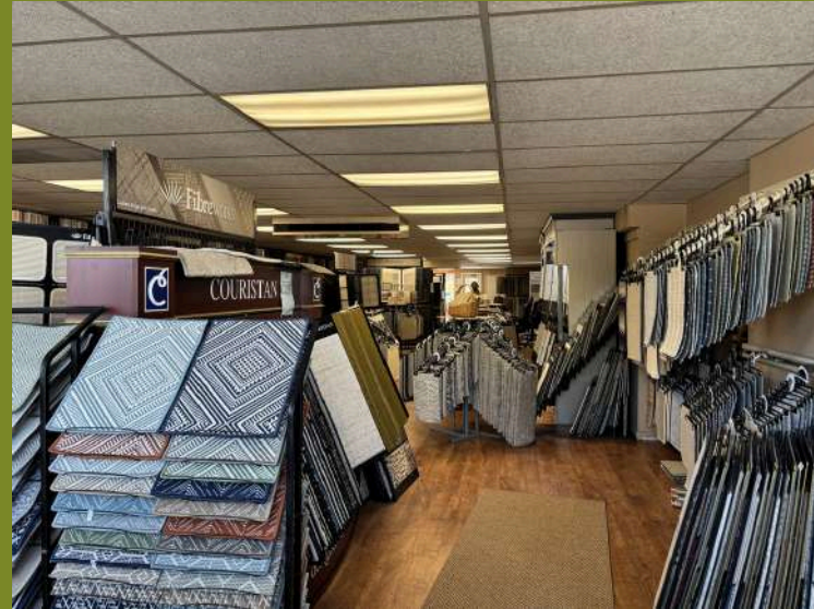
Front to Back View