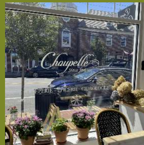
Crepes – 1027 Boston Post