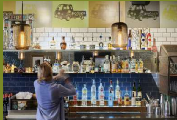
Bodega Taco Bar – 980 Boston Post