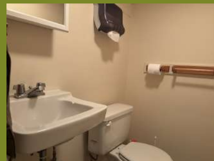
Two (2) Bathrooms