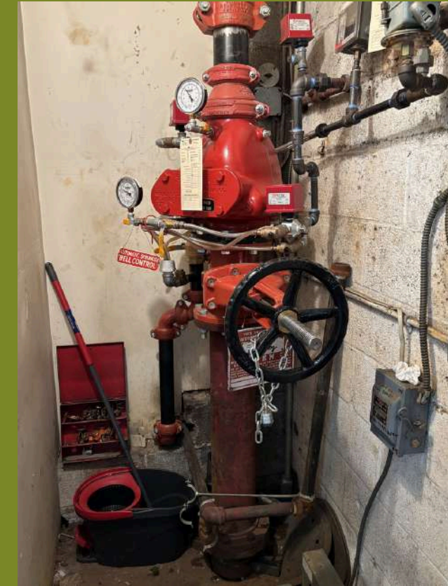
Building Sprinkler Control System