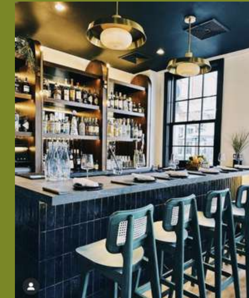
Granola Bar – 1020 Boston Post