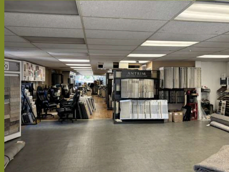
Back to Front View