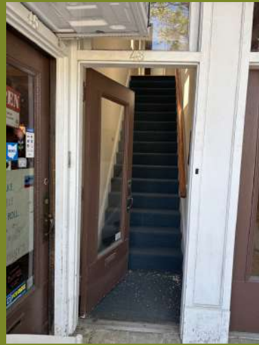
Office Front Stairs