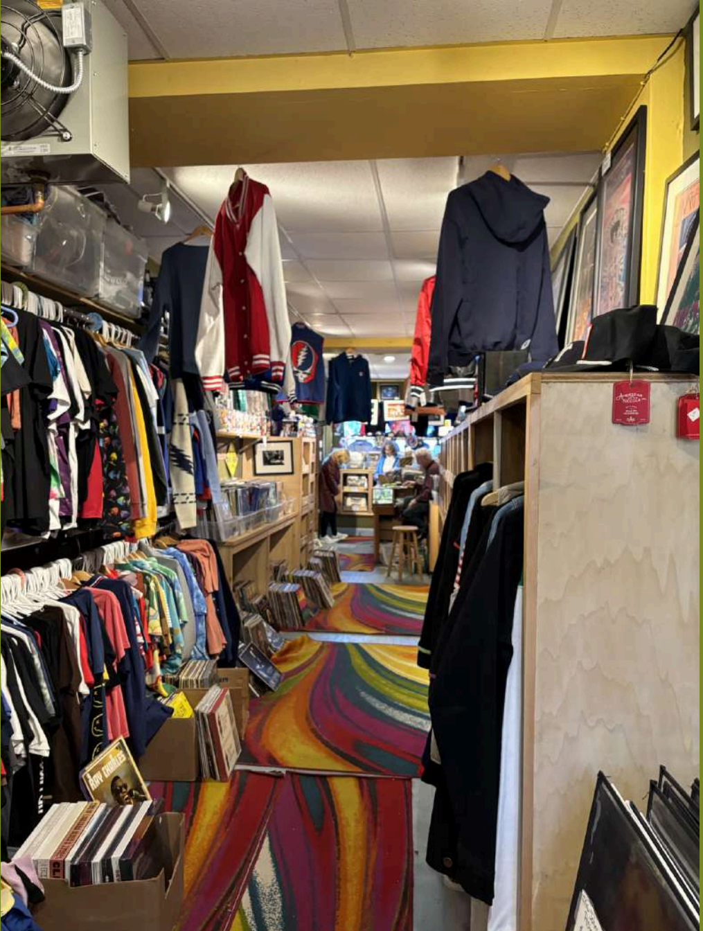
Back to Front View