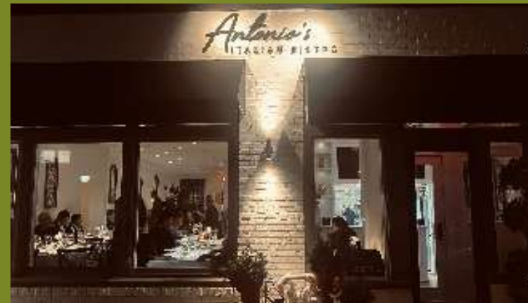
Antonio's Italian Bistro – 971 Boston Post