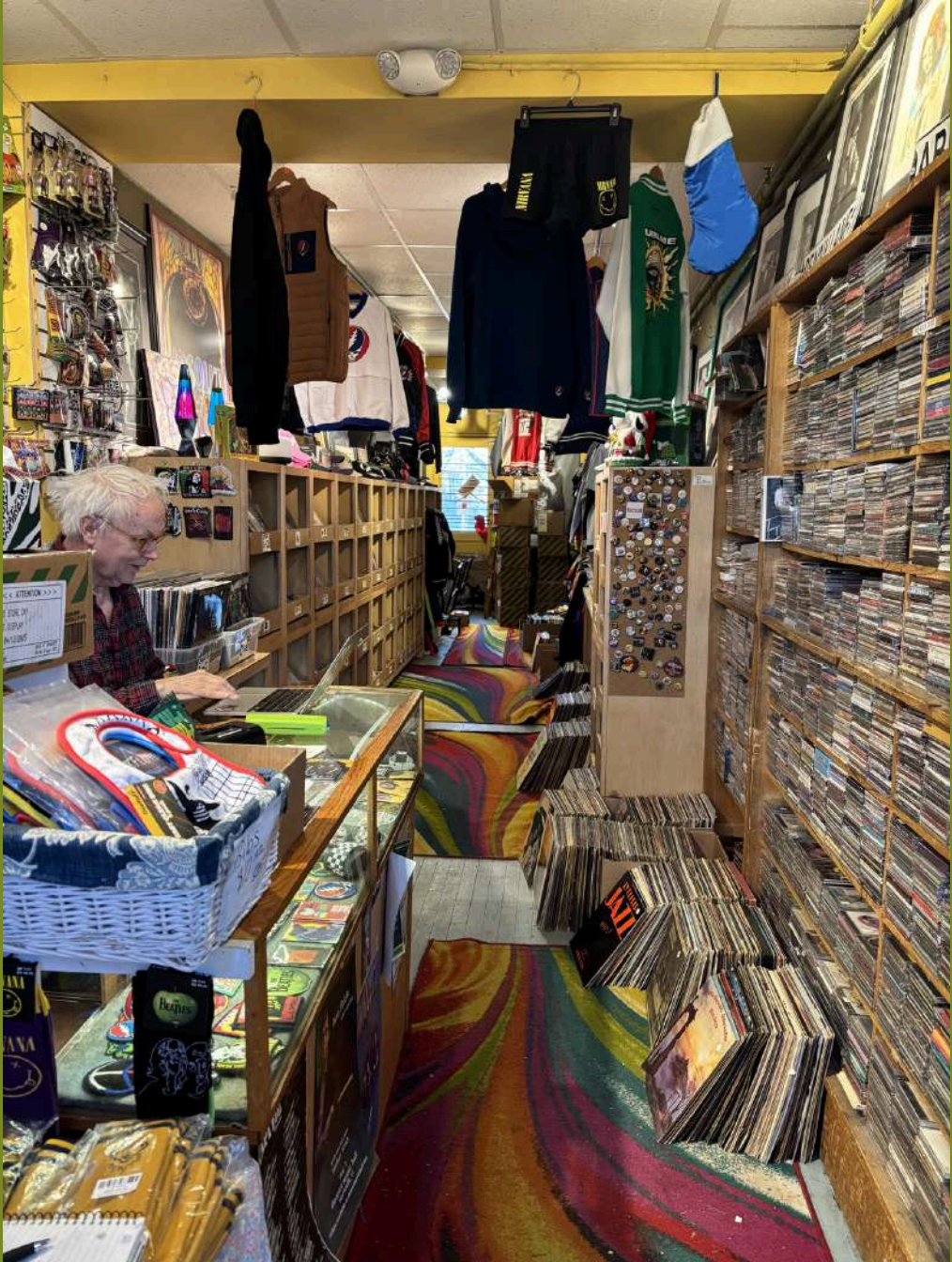
Front to Back View