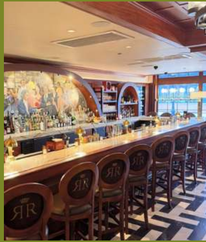
Roots Steakhouse – 14 Grove Street