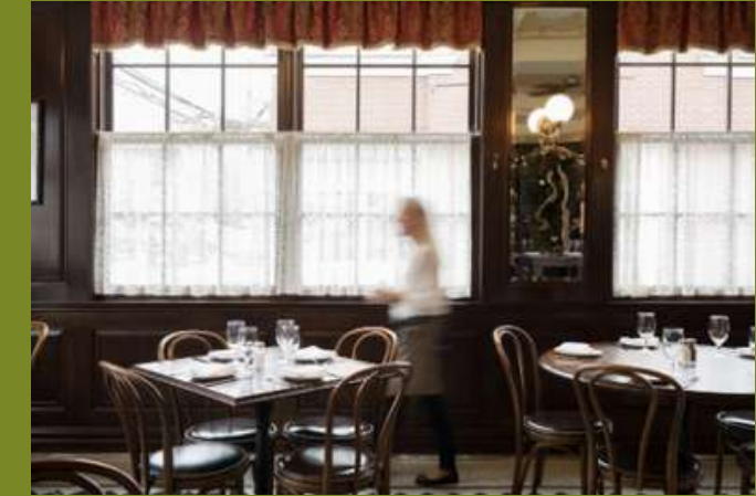
Ten Twenty Post – 1020 Boston Post