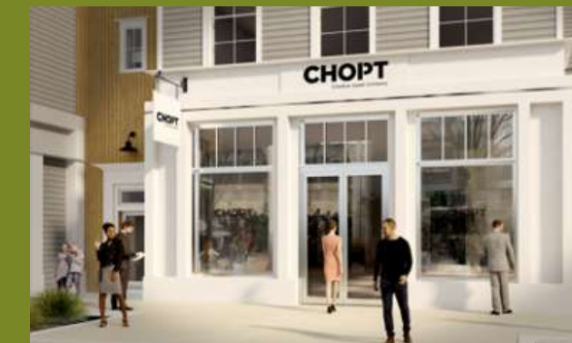
Chopt – 20 Corbin Drive