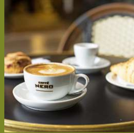
Cafe Nero – 1071 Boston Post