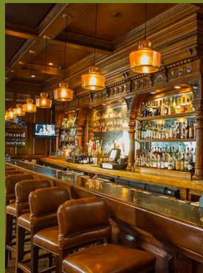
The Goose American Bistro & Bar 972 Boston Post