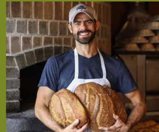
Flour Water Salt Bread 20 Grove Street