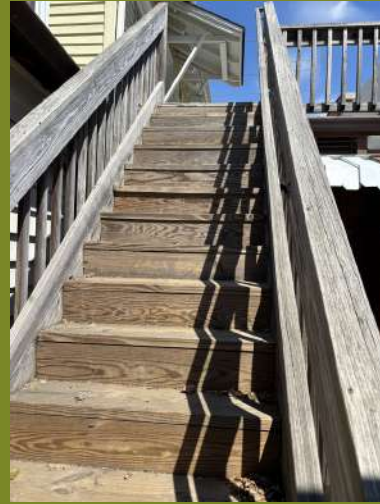
Office Rear Stairs