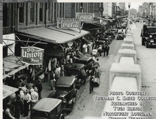
PHOTO COURTESY THURMAN C. SMITH COLLECTIVE RESEARCHED BY TWIN BLENDS NORTHWEST LOUISIANA HISTORY HUNTERS