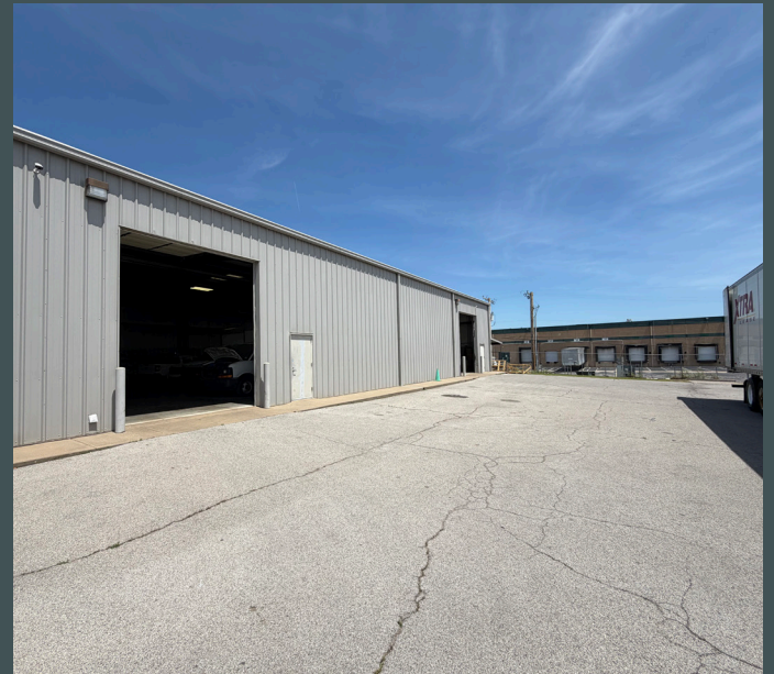
Fenced Yard Area