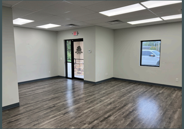
Typical Office Finishes