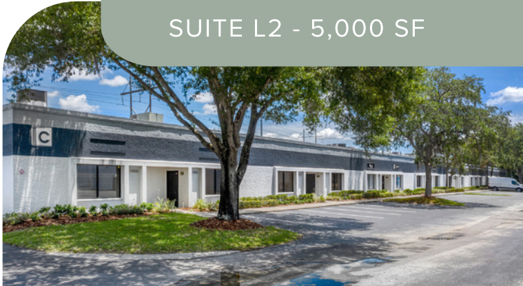
SUITE L2 - 5,000 SF

14110-14115 MCCORMICK DRIVE, SUITE L2 | TAMPA, FL 33626