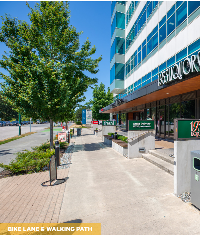
BIKE LANE & WALKING PATH