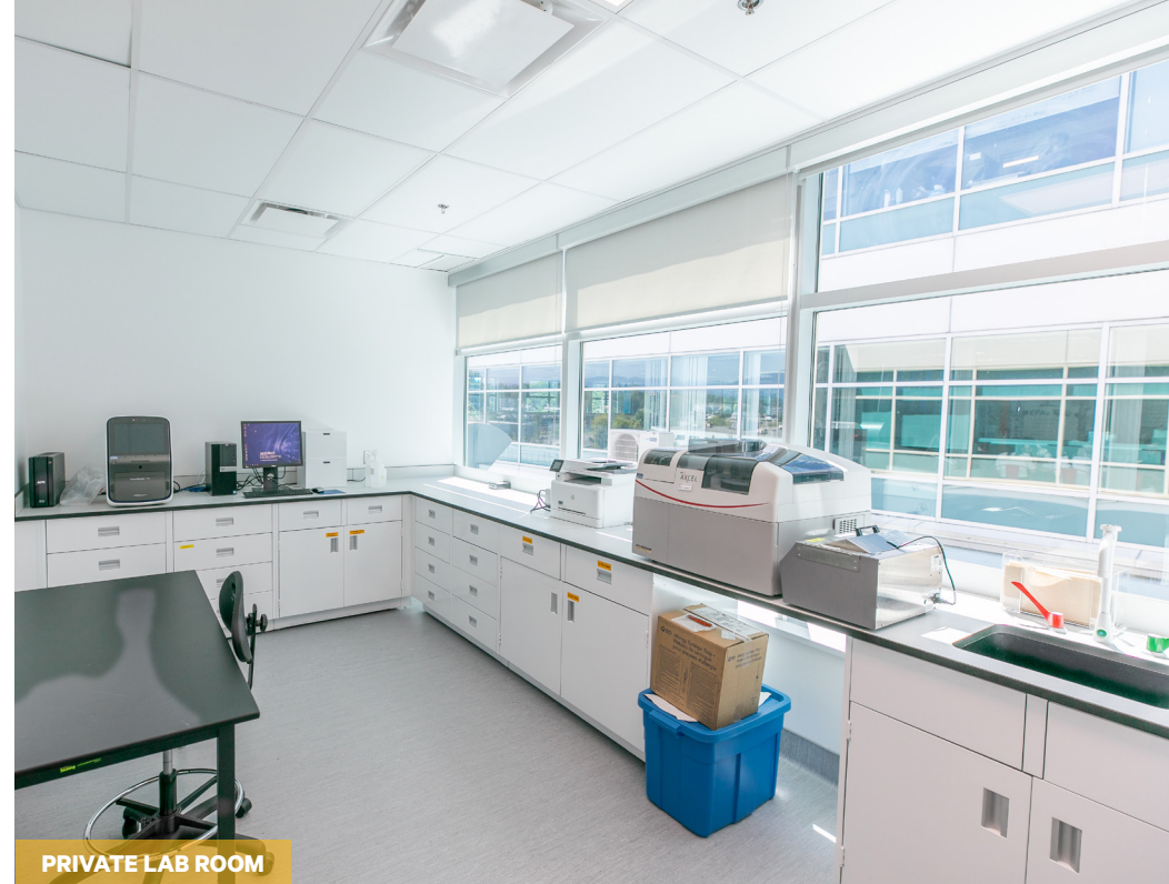
PRIVATE LAB ROOM