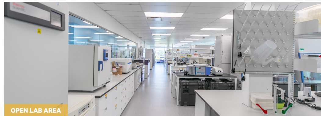
OPEN LAB AREA