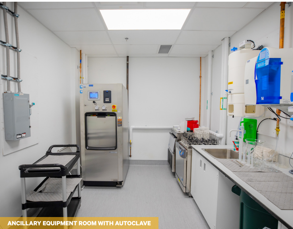
ANCILLARY EQUIPMENT ROOM WITH AUTOCLAVE