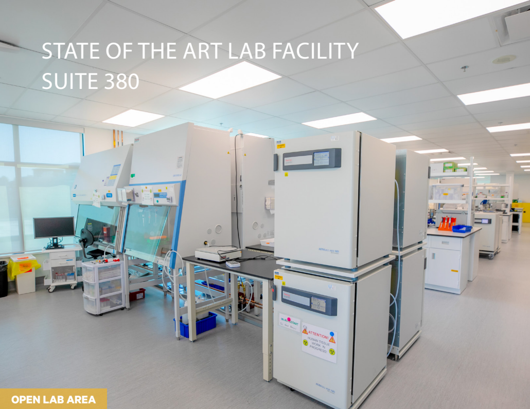
OPEN LAB AREA