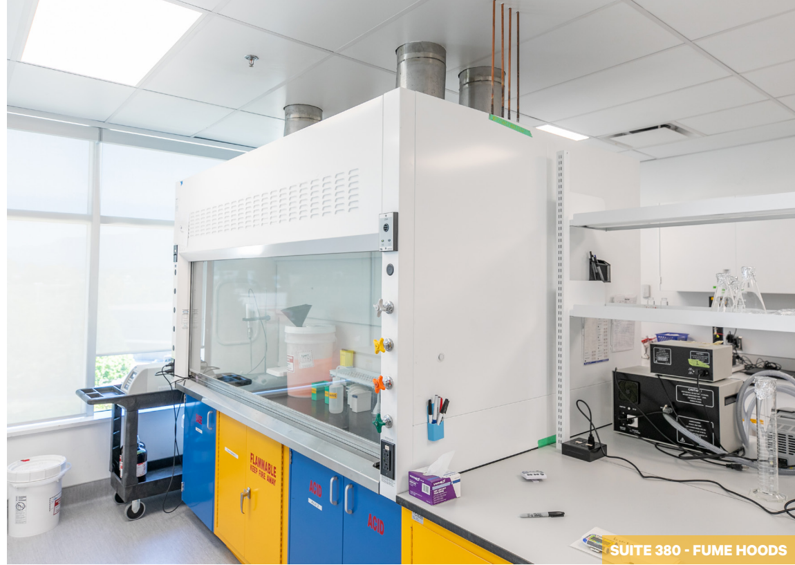
SUITE 380 - FUME HOODS