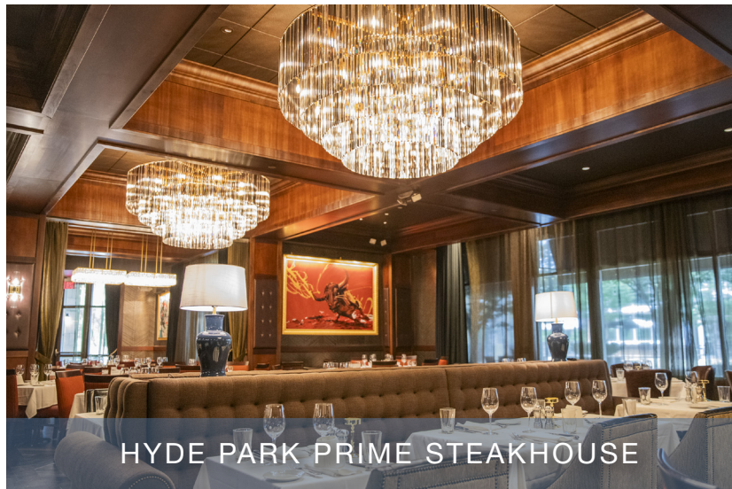
HYDE PARK PRIME STEAKHOUSE