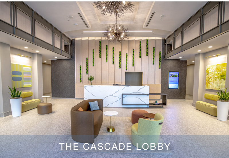
THE CASCADE LOBBY