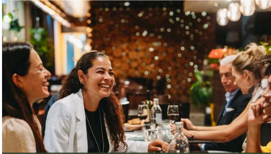
Many restaurant options minutes away

Whether you need to grab lunch, shop for a last-minute gift or squeeze in a workout, it's all here. And when business is done, the options for play are endless, from games to drinks to live music... even a NASCAR race.