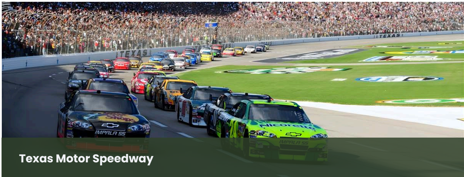
Texas Motor Speedway