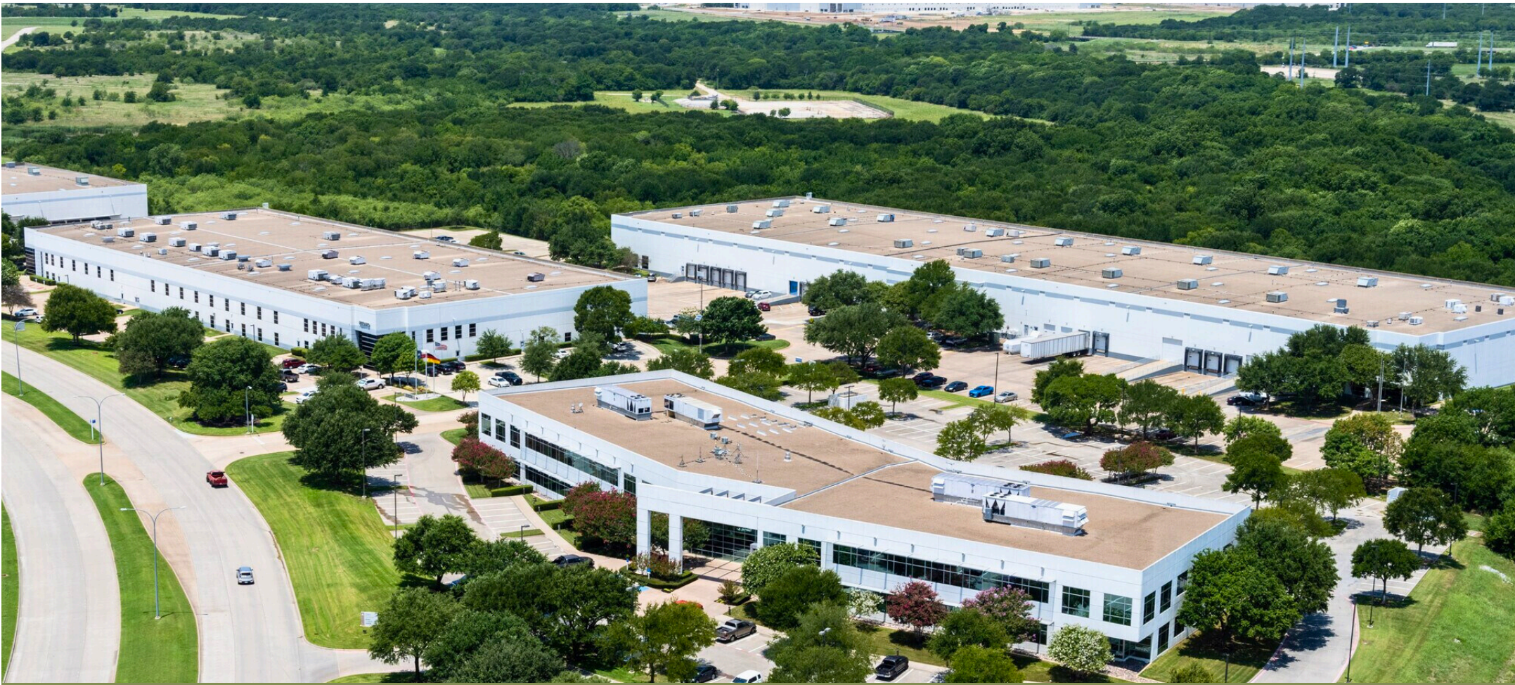
Located in AllianceTexas , home to home to 60+ Fortune 500 Companies