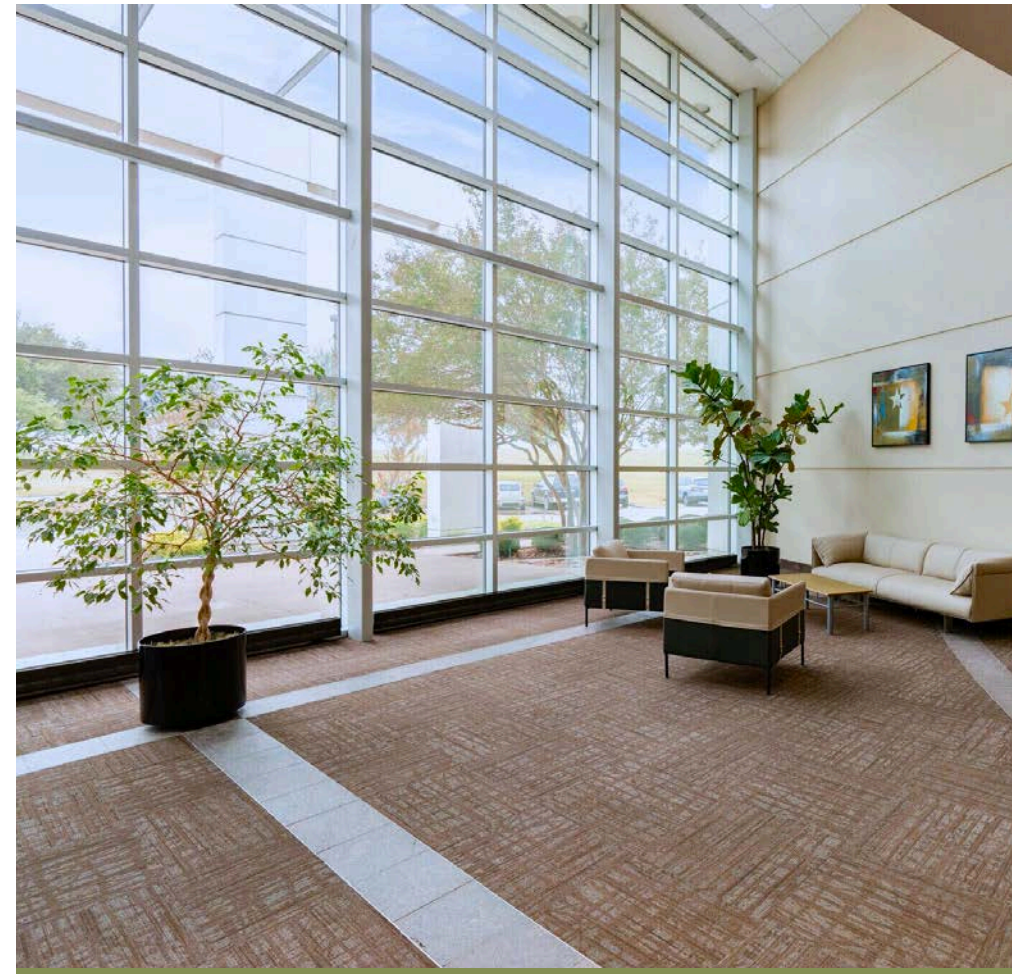
Floor to ceiling glass in the atrium