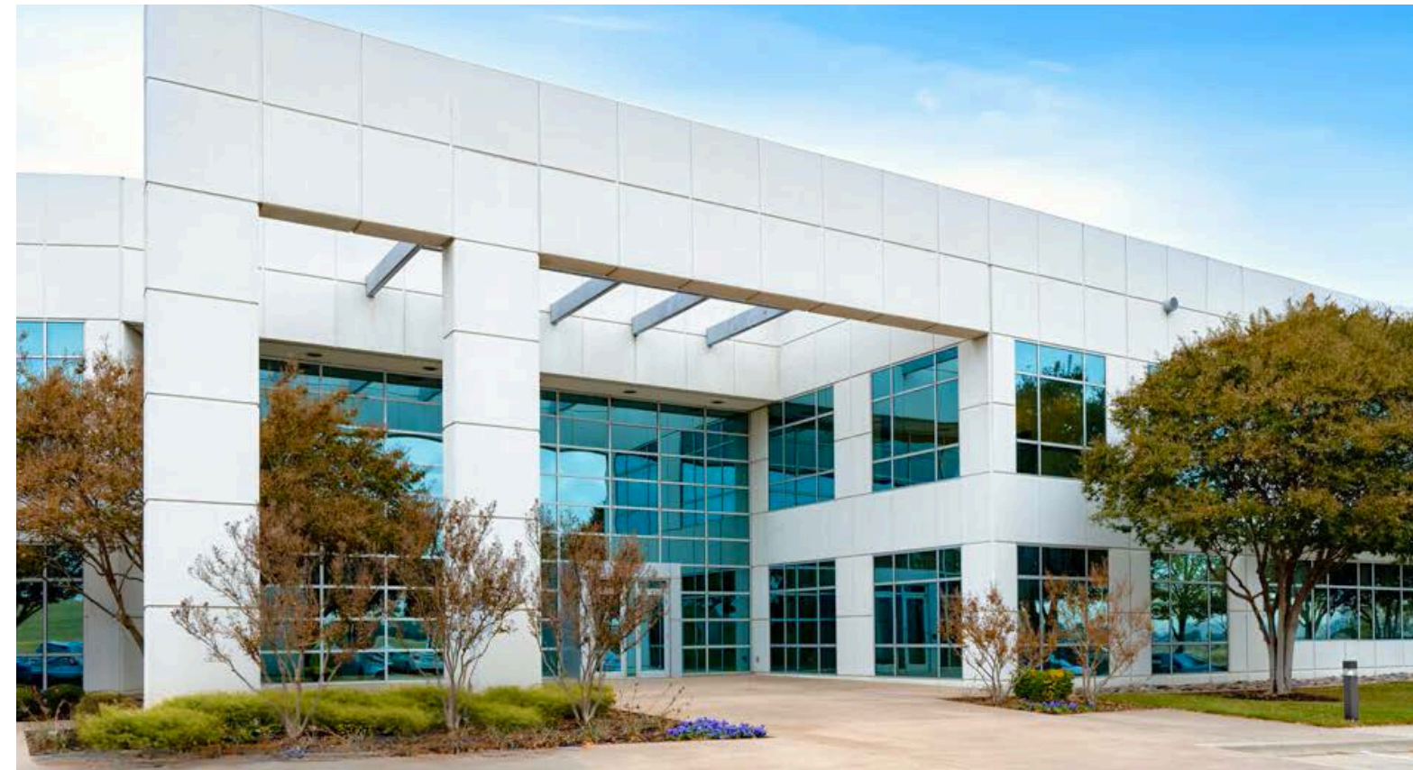
Easy access to entry