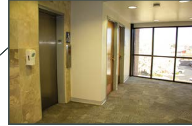
DIRECT ELEVATOR ACCESS