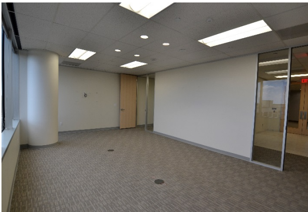
12 Person Conference Room