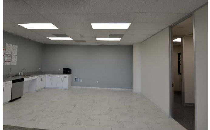
Large Break Room / Lounge