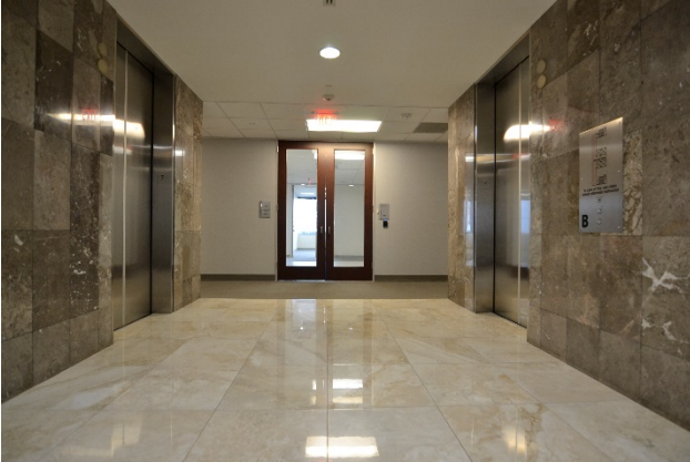
Entry from Elevator Lobby