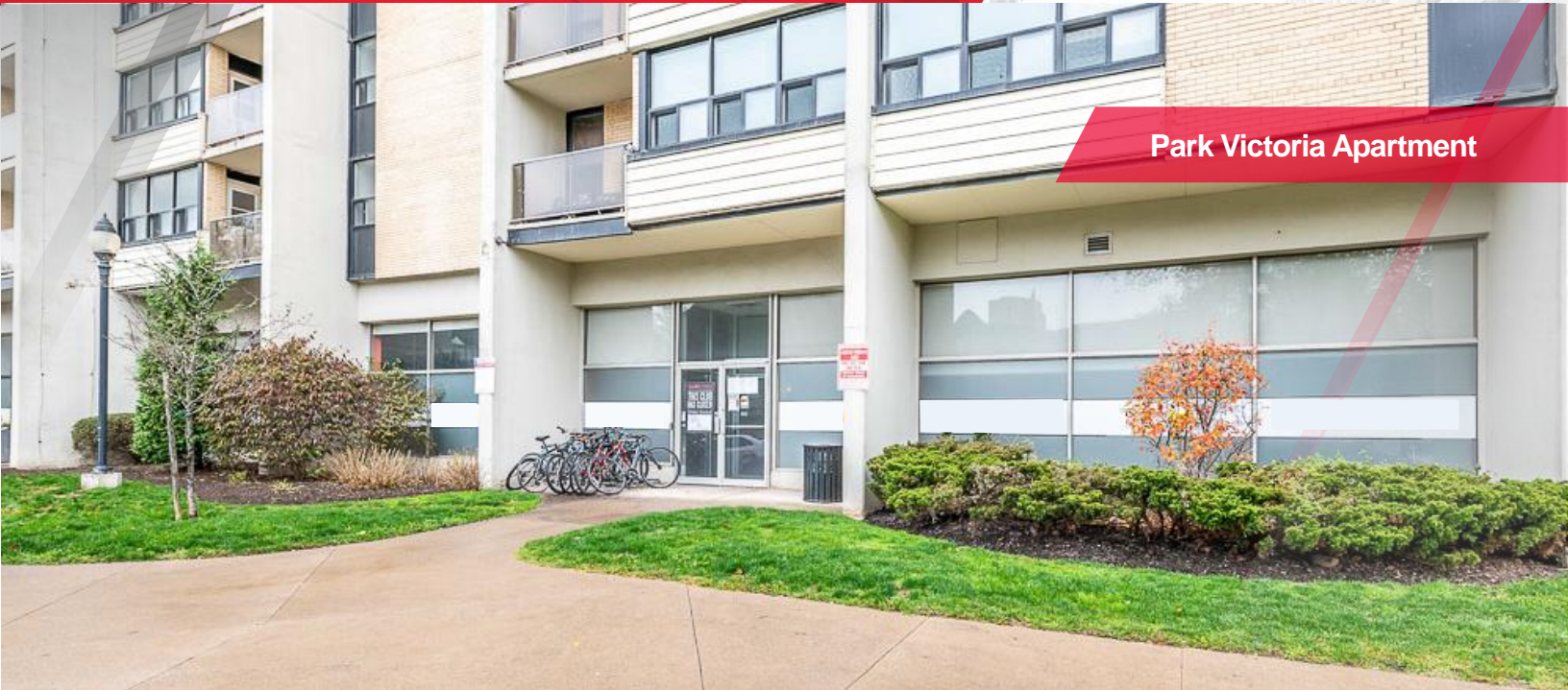
Park Victoria Apartment

9,551 sf Ground Floor Retail Space | Lease Rate: $16.00 psf Semi-gross