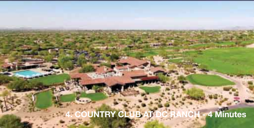
4. COUNTRY CLUB AT DC RANCH - 4 Minutes