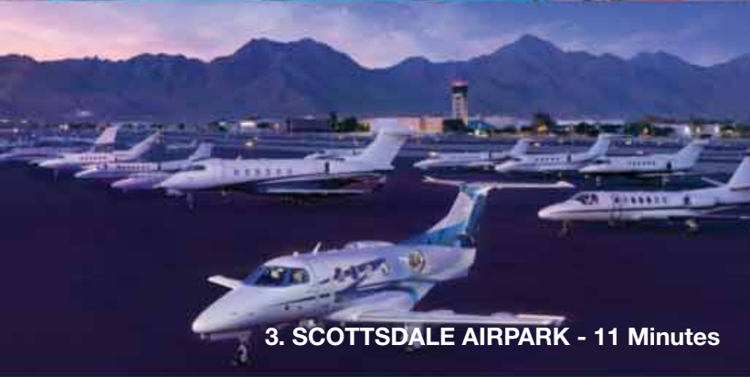
3. SCOTTSDALE AIRPARK - 11 Minutes