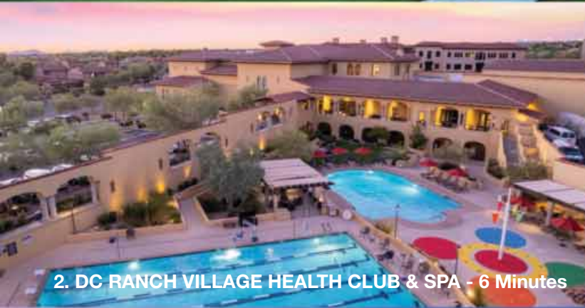
2. DC RANCH VILLAGE HEALTH CLUB & SPA - 6 Minutes