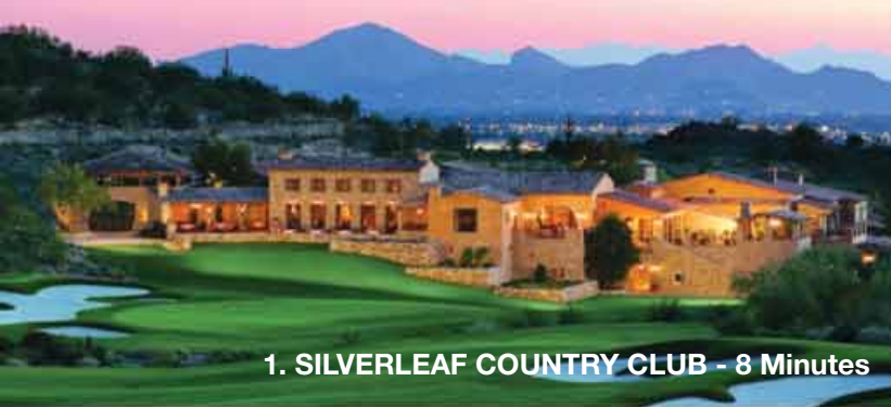
1. SILVERLEAF COUNTRY CLUB - 8 Minutes