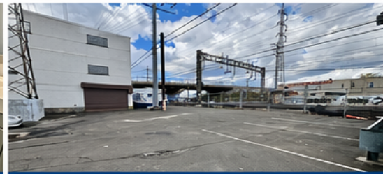
SECURE OUTDOOR YARD