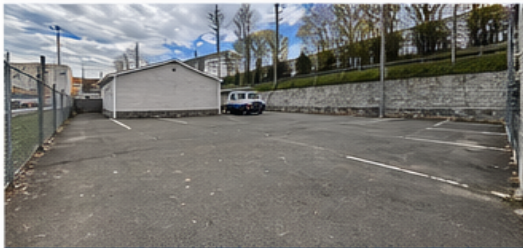
AMPLE YARD & PARKING AREA