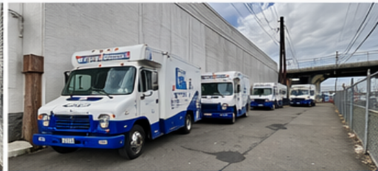
TRUCK PARKING / FLEET STORAGE